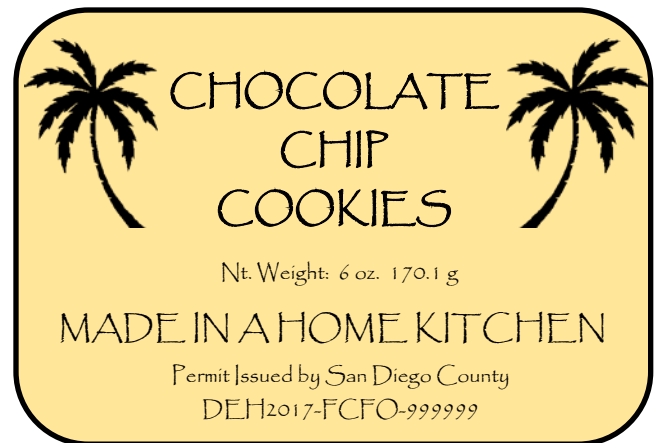
Principal Display Panel