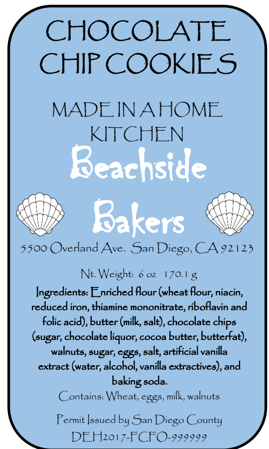
CLASS B CFO Label Sample Uses the wording "Permit Issued By"

*The smallest acceptable letter size for the label text is 1/16 th of an inch in height measured at a lower case "o", with the exception of "Made in a Home Kitchen" or "Repackaged in a Home Kitchen" which is required to be at least 12 point font.