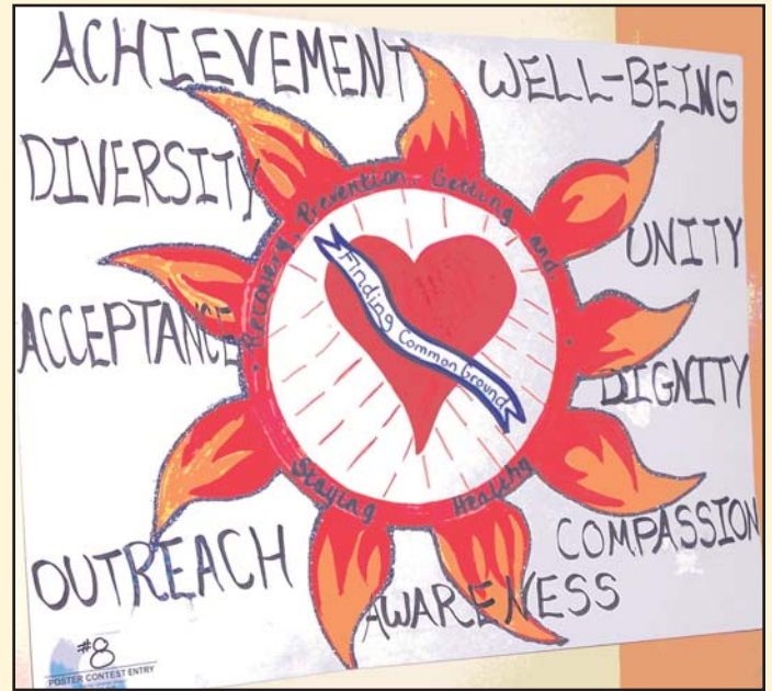
Poster contest entry highlights benefits of finding Common Ground.

The planning committee looks forward to finding more common ground at next year's workshop.