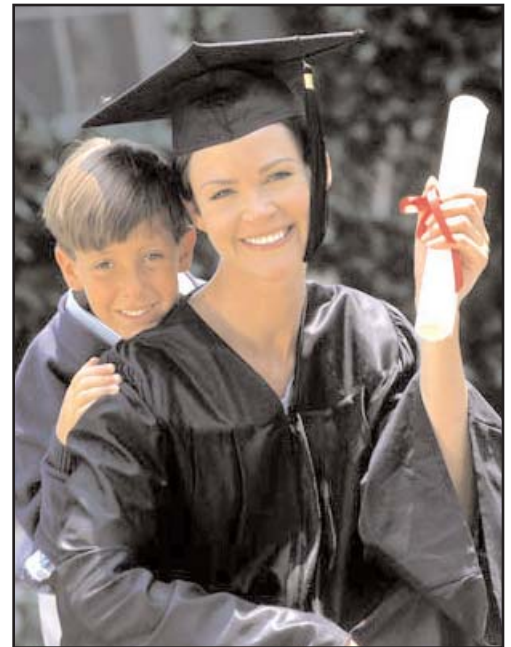
Parenting is not an easy job. North County conference helped parents find the power within.

More than 60 people attended the event. North County HHSA also participated in the MiraCosta College Job Fair on April 27. About 50 employers (including our own Human Resources) were at the Job Fair and recruited for various positions. Both events were part of MiraCosta's Career Expo, a week long series of events that also included work readiness trainings and a fashion show.