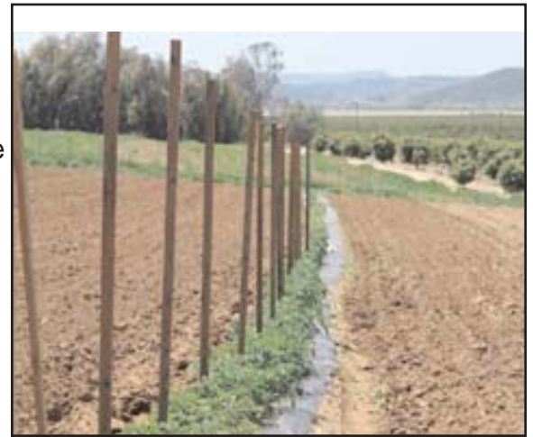
The fields of San Pasqual Academy are sown.

Through the Agriculture Program, the Academy is further enhancing the program opportunities for the youth. In the future, look for the fruits...and vegetables...of the students' labor at your local farmers market!