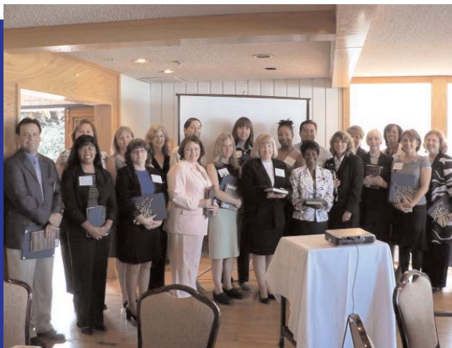
2006 Managers Development Institute graduates (top) and mentors (below).

Annual National Association of Counties Achievement Award and was one of only 14 "Best of Category" winners nationwide.