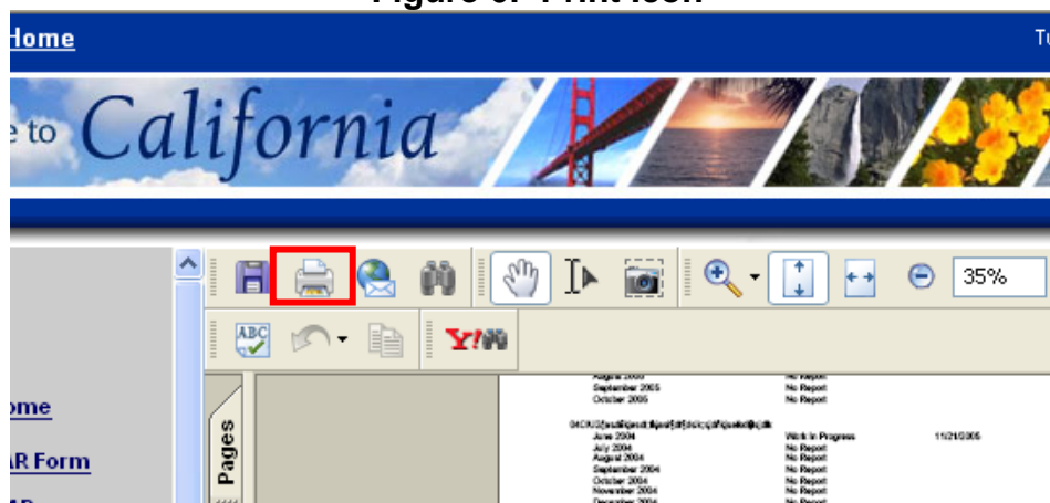
Figure 6: Print Icon