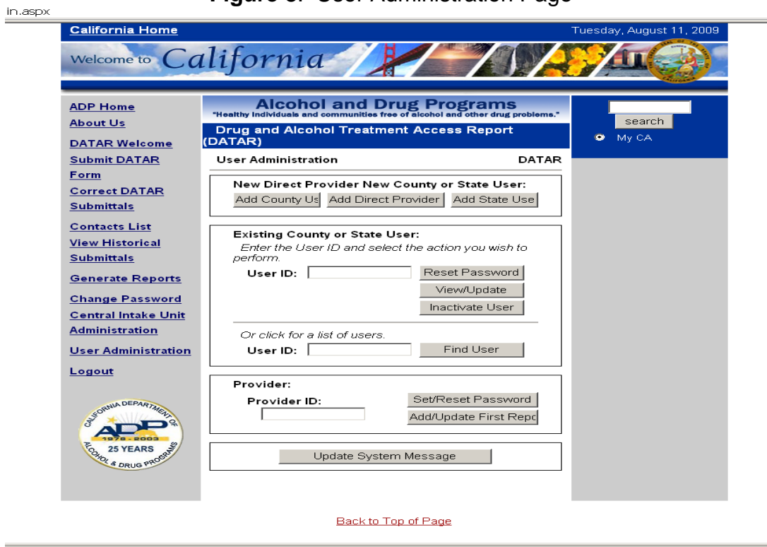
Figure 8: User Administration Page

Figure 8 displays the User Administration page from an ADP user perspective.