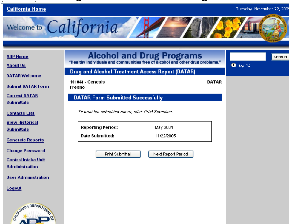
Figure 4: Confirmation Message