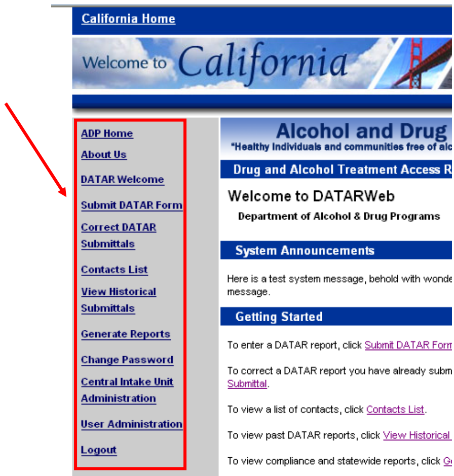
Figure 2: Navigation Links

The navigation bar displays no matter where you are in the system allowing you to navigate easily from page to page.