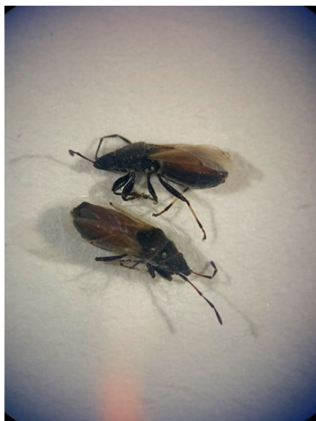
Cotton seed bug ( Oxycarenus hyalinipennis, Hemiptera: Lygaeidae).

Cotton Seed Bug ( Oxycarenus hyalinipennis ) Hemiptera: Oxycarinidae, A-rated) has been found in several locations throughout the county through reports from local Community College classes and from follow-ups to iNaturalist posts. This insect is especially concerning for its potential destructive feeding impact on commercial cotton Gossypium spp. production, as a pest of landscape Malvaceae, including species of hibiscus and mallow, and rare native plants in this family. It has previously been found in Los Angeles and nearby counties, but was not previously thought to be established in the USA. The insect is a small, brown bug, with few distinctive features; it may be more widely distributed than official records indicate. More information on the history and impact of this pest is available in CDFA's Pest Rating Proposal: https://blogs.cdфа.ca.gov/Section3162/wp-content/uploads/2019/07/PRP2019-Oxycarenus_Profile_ADA.pdf