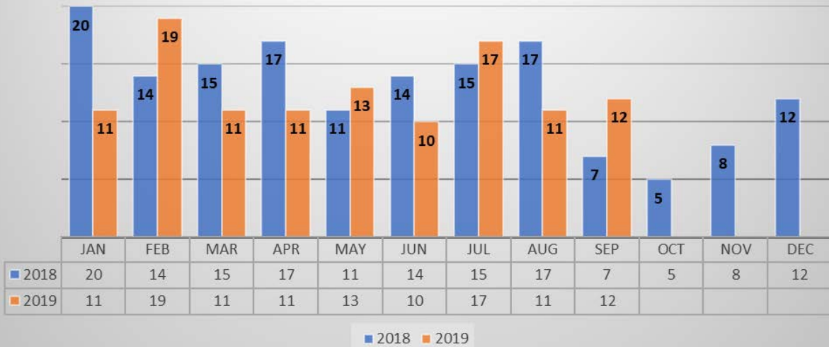
Five Year Received Complaints / Active Investigations