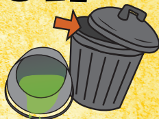
Containers & buckets

Aedes mosquito larvae can survive in very small amounts of water - even 1/4" is too much: Dump it out!