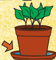
Potted plant saucers