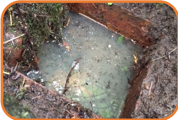
Water collecting in a tree hole

Tree holes, as well as holes in soil or cement can collect enough water to breed mosquitoes. Fill these holes with sand, cement, or soil to prevent water from pooling.