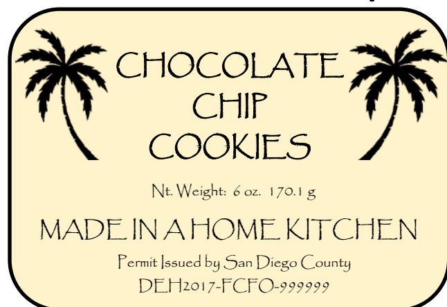
Principal Display Panel