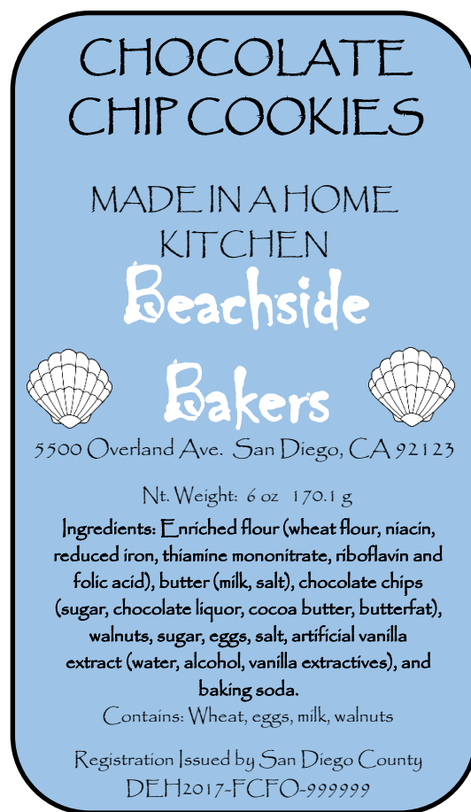
CLASS A CFO Label Sample Uses the wording "Registration Issued By"

*The smallest acceptable letter size for the label text is 1/16 th of an inch in height measured at a lower case "o", with the exception of "Made in a Home Kitchen" or "Repackaged in a Home Kitchen" which is required to be at least 12 point font.