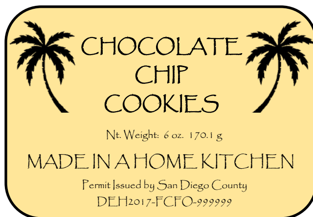
Principal Display Panel

Allergen Declaration - If the food contains any of the major food allergens: milk, eggs, tree nuts (e.g., almonds, pecans, walnuts), wheat, peanuts, or soybeans (or soy based products), a declaration of the allergens present must be provided.