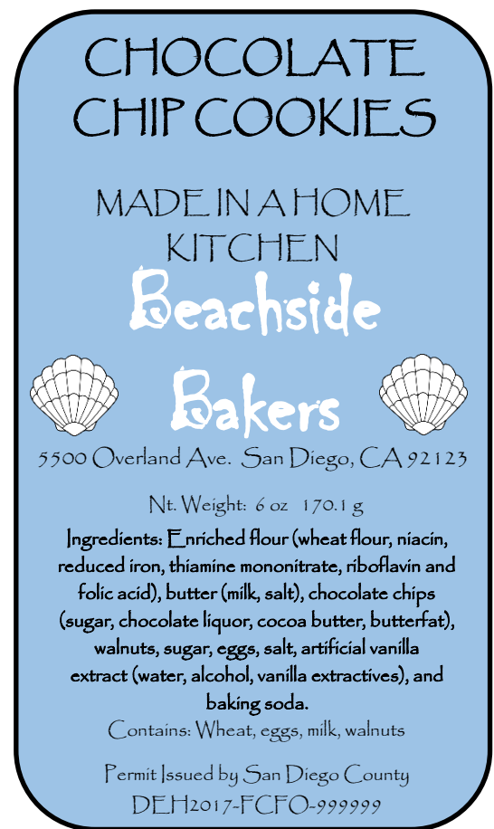
CLASS B CFO Label Sample Uses the wording "Permit Issued By"

*The smallest acceptable letter size for the label text is 1/16 th of an inch in height measured at a lower case "o", with the exception of "Made in a Home Kitchen" or "Repackaged in a Home Kitchen" which is required to be at least 12 point font.