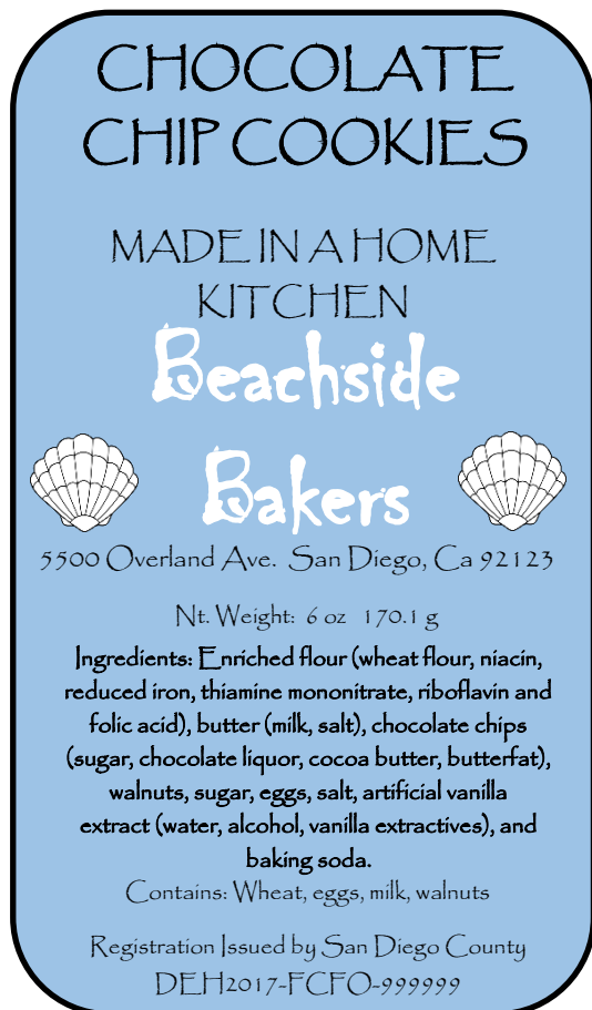
CLASS A CFO Label Sample Uses the wording "Registration Issued By"