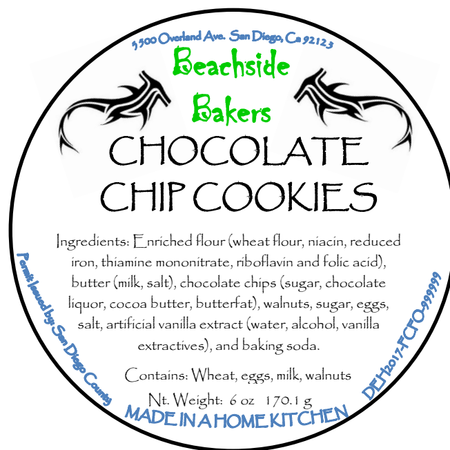
CLASS B CFO Label Sample Uses the wording "Permit Issued By"