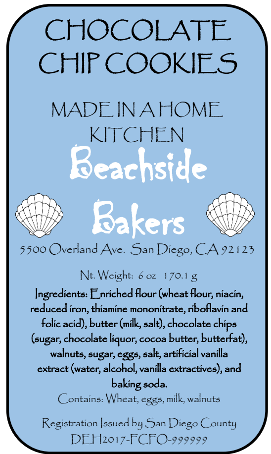
CLASS A CFO Label Sample Uses the wording "Registration Issued By"

*The smallest acceptable letter size for the label text is 1/16 th of an inch in height measured at a lower case "o", with the exception of "Made in a Home Kitchen" or "Repackaged in a Home Kitchen" which is required to be at least 12 point font.