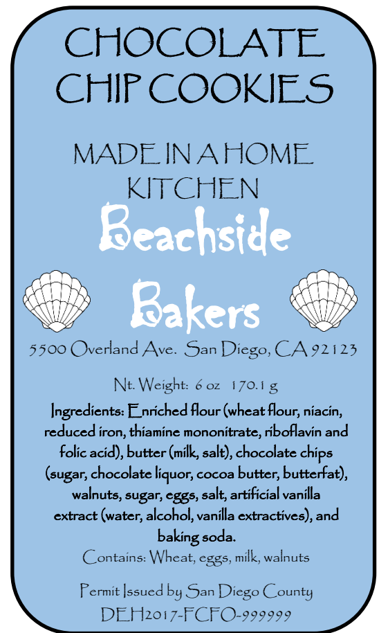
CLASS B CFO Label Sample Uses the wording "Permit Issued By"

*The smallest acceptable letter size for the label text is 1/16 th of an inch in height measured at a lower case "o", with the exception of "Made in a Home Kitchen" or "Repackaged in a Home Kitchen" which is required to be at least 12 point font.