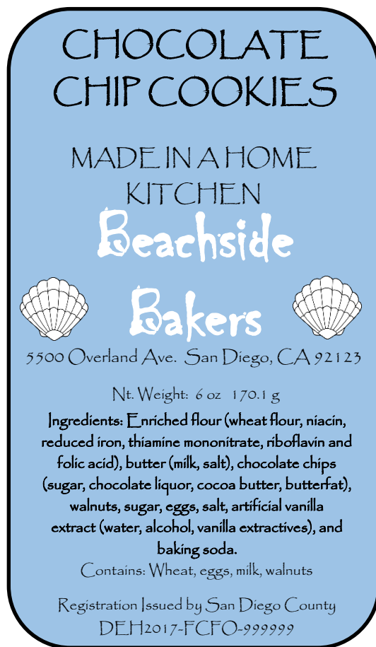
CLASS A CFO Label Sample Uses the wording "Registration Issued By"

*The smallest acceptable letter size for the label text is 1/16 th of an inch in height measured at a lower case "o", with the exception of "Made in a Home Kitchen" or "Repackaged in a Home Kitchen" which is required to be at least 12 point font.