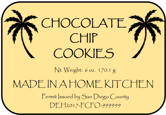
Principal Display Panel