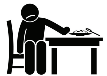
Loss of appetite