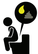
Dark urine, pale stools, and diarrhea

If you think you have Hepatitis A because of these symptoms, see your doctor or visit the closest Emergency Room. Always wash your hands with soap and water after going to the bathroom and before preparing food.