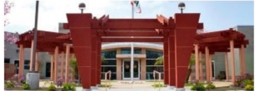
North Shelter 2481 Palomar Airport Road, Carlsbad, CA 92011