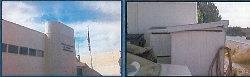
Palomar Airport Advisory Committee February 16, 2017 Agenda Item #6