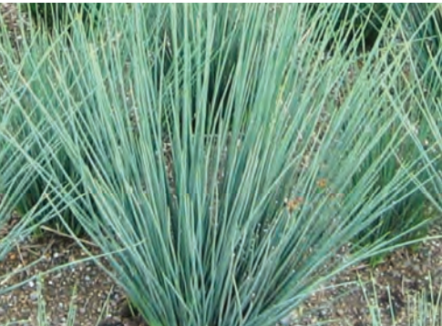
California Gray Rush