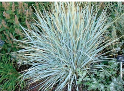
Canyon Prince Wild Rye