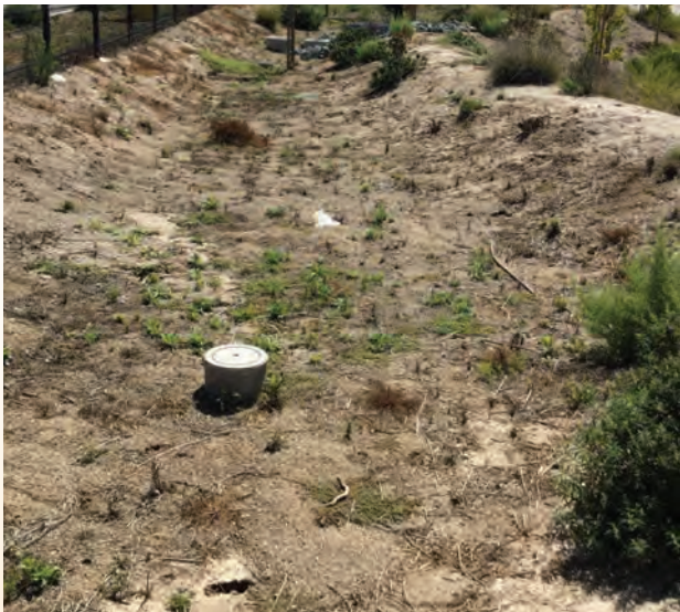
Vegetation in poor health