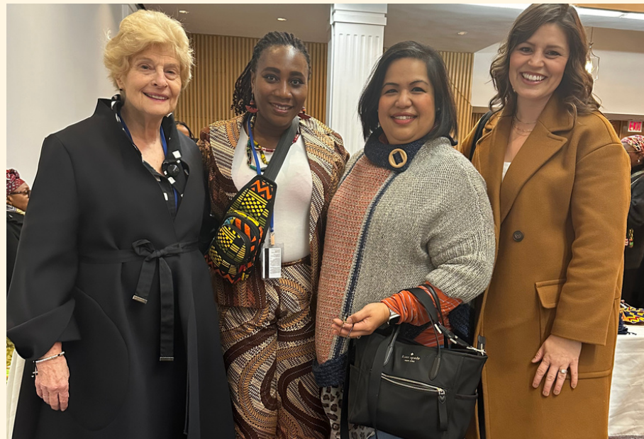
Learning from Innovators