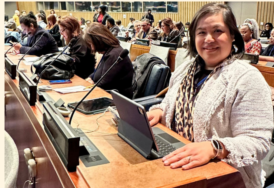
Participating in Convenings