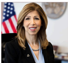
SD COUNTY DISTRICT ATTORNEY SUMMER STEPHAN