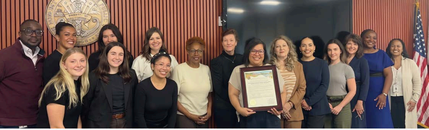
San Diego County Commission on the Status of Women and Girls and the Office of Equity and Racial Justice