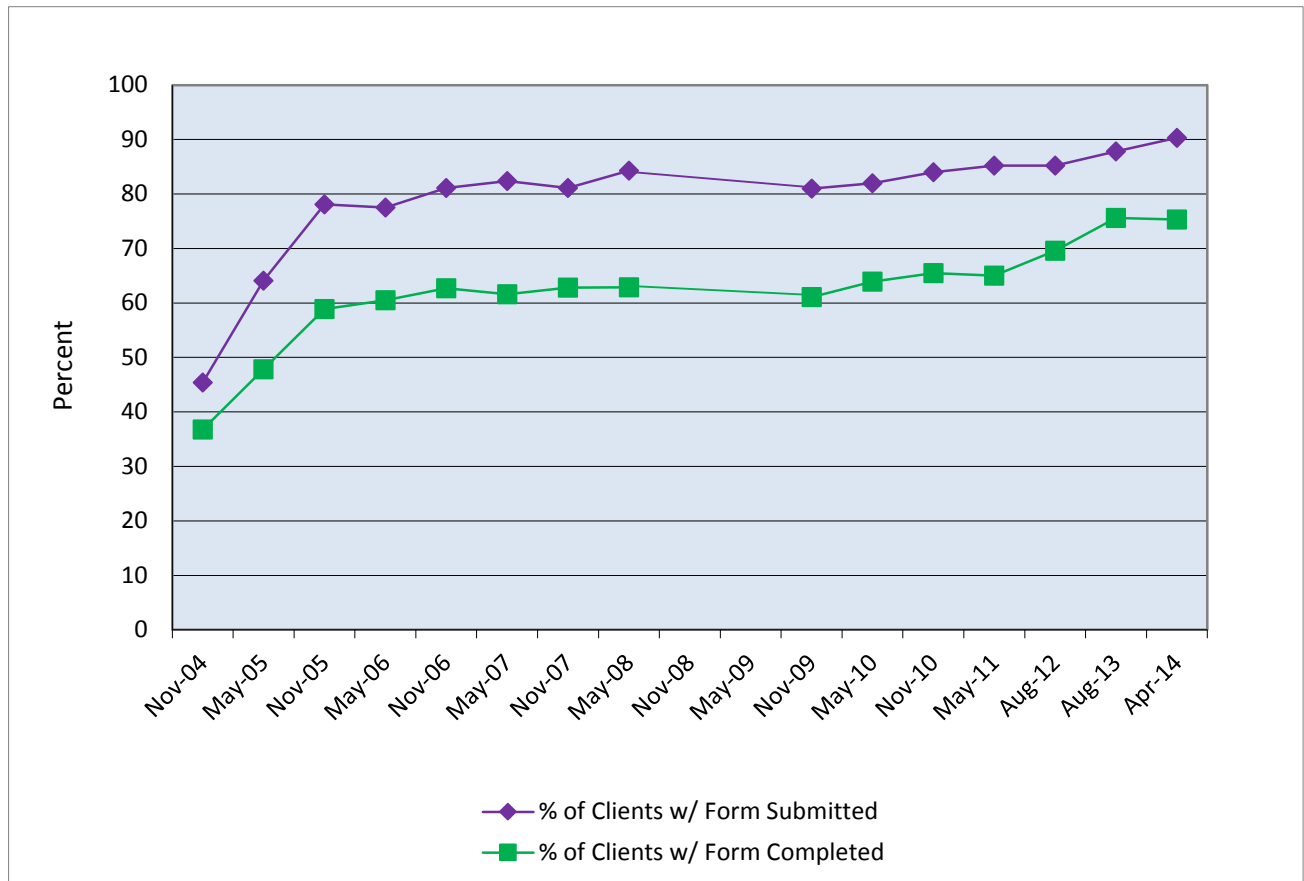
Figure 1. YSS Submission & Completion rates*

*Compliance data are unavailable for the November 2008 and May 2009 survey periods, during which a database transition from INSYST to Anasazi was in progress.