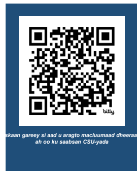
Skann gareey si aad u aragto macluumaad dheeraad ah oo ku saabsan CSU-yada