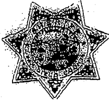
Exhibit 1 DEPARTMENT OF THE SHERIFF County of San Diego WILLIAM KOLENDER, SHERIFF SECURITY CLEARANCE BLDG. 2 ROOM 360 SAN DIEGO, CA. 92123

GENERAL SERVICES FACILITIES SERVICES SECURITY 5655 OVERLAND AVE. BLDG. 2 ROOM 360 SAN DIEGO, CA. 92123 MS 0366