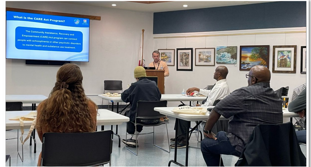
CARE Act Information Session