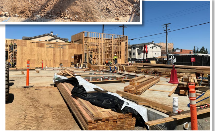
East County Crisis Stabilization Unit