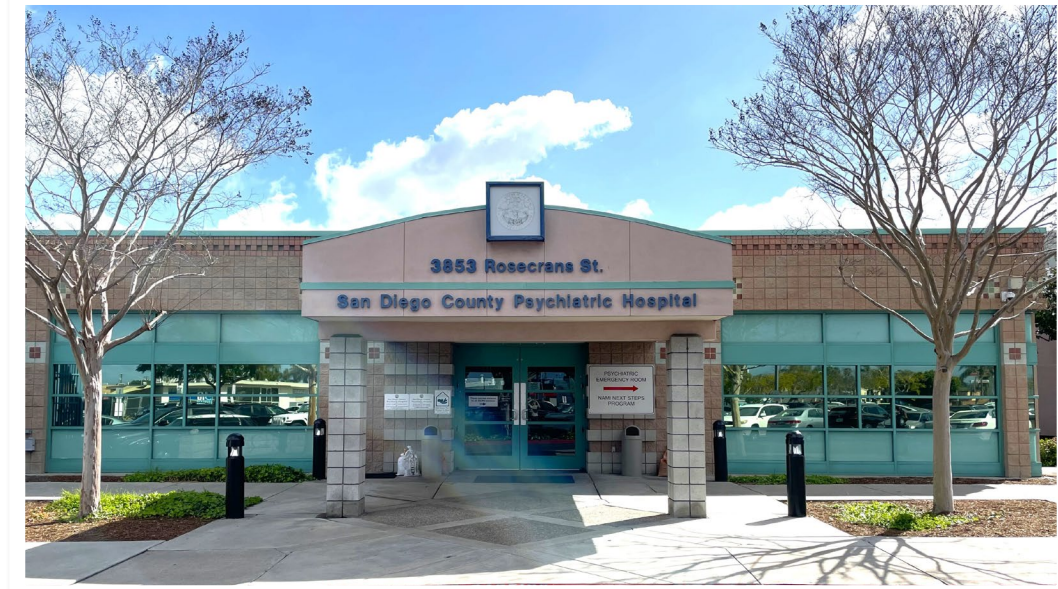
San Diego County Psychiatric Hospital