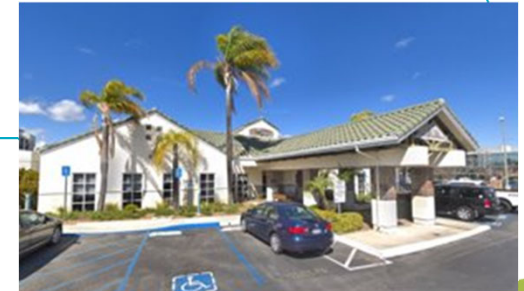
Children's Crisis Residential Care Facility