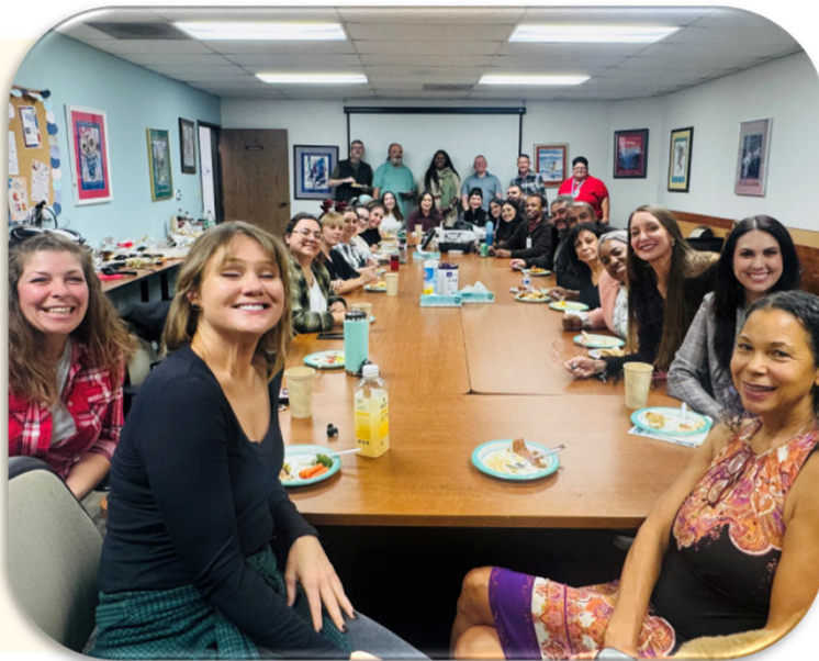
BHS Case Management Team