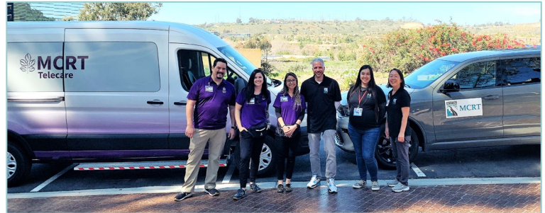
Providers of the County's Mobile Crisis Response Team

Available countywide and to people of all ages, MCRT is an alternative to law enforcement response with teams comprised of behavioral health experts who are trained to respond in the community and de-escalate crises related to alcohol, drugs, or mental health conditions.