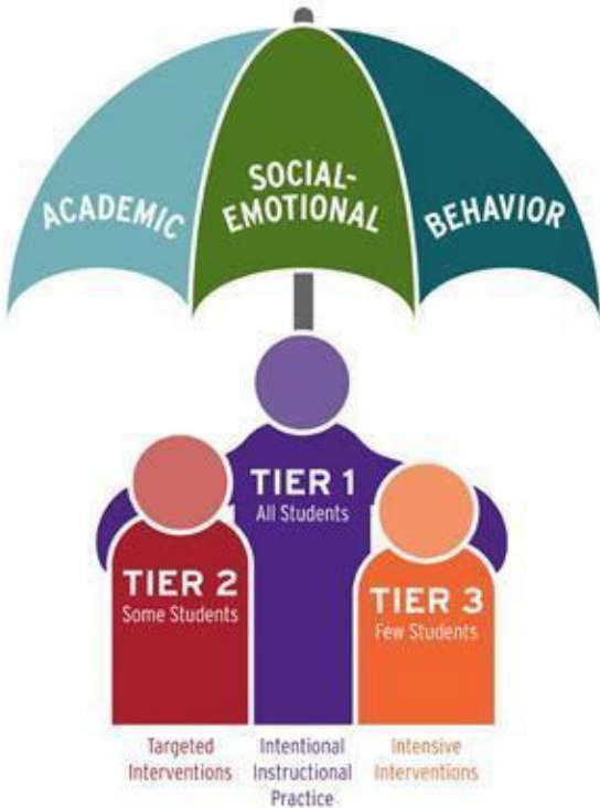
MULTI-TIERED SYSTEM OF SUPPORTS (MTSS)