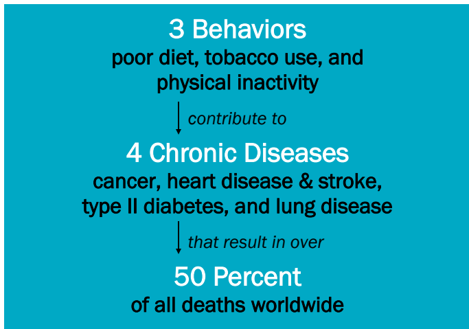
Figure 1: 3-4-50 Death Percentages