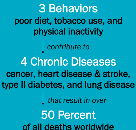
Figure 1: 3-4-50 Death Percentages