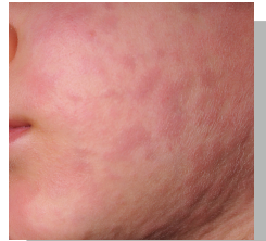
Measles rash on cheek