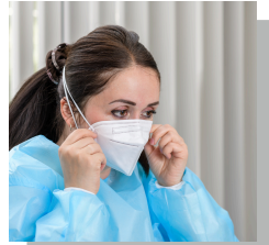
Putting on PPE