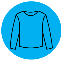
Wear loose-fitting, long-sleeved shirts and pants.