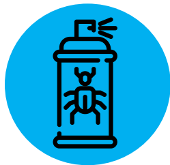
Use insect repellent, and treat clothing and gear with permethrin (insecticides).