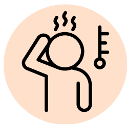
Fever with any of the following