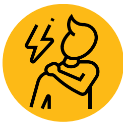
Aches and pains