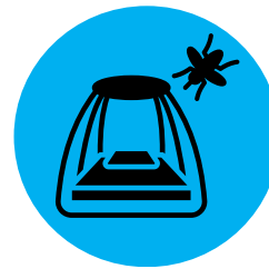
Sleep under a mosquito net if you are outside or when screened rooms are not available.