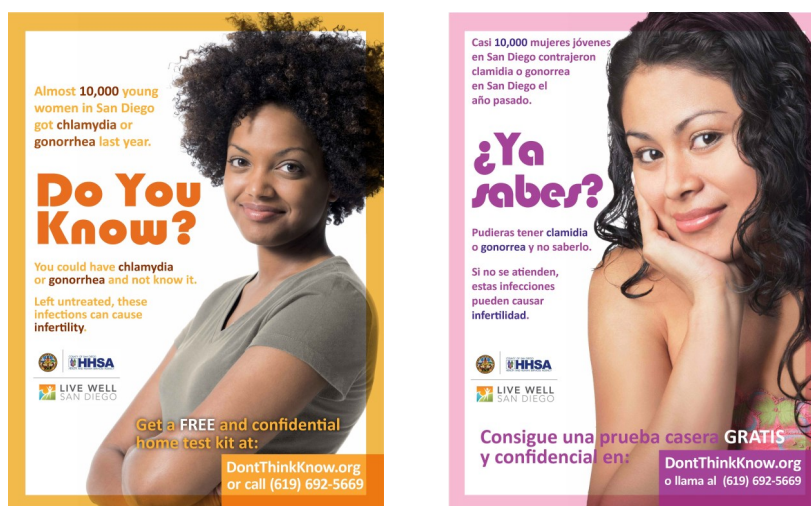
Examples of Don't Think, Know promotional materials.

For more information about Don't Think, Know or to request FREE outreach materials, please e-mail Jamie.Schroer@sdcounty.ca.gov or call (619) 514-8622 .