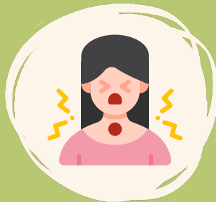
Very red, sore throat