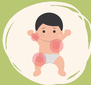
Bright red skin