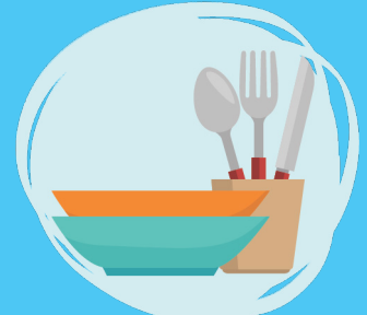
Wash utensils used by a sick person.