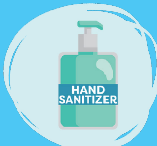
Use hand sanitizer if water and soap are not available.