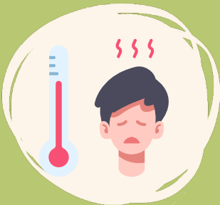
Fever or chills