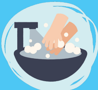
Wash your hands frequently.