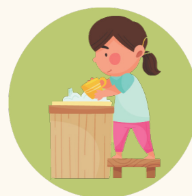
Wash glasses, utensils, and plates after each use.