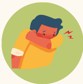
Cover your cough or sneeze.