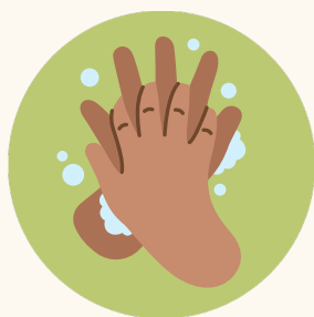
Wash your hands with soap and water.