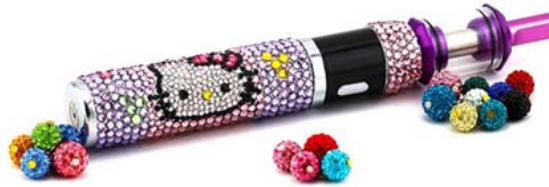
Figure 3: E-cigarette products and accessories.

The use of cartoon characters in advertising and promoting of e-cigarettes as fashion accessories are other ways these products appeal to youth with the implication that these products are harmless (see Figure 3). E-cigarette manufacturers report sponsoring concerts, sporting events, and parties that include the distribution of free samples; many of these events occurred in California. 32 Another tactic to create a perception that e-cigarettes are family friendly is through the association of these products with family oriented attractions.