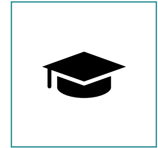
Vacant Graduate Student Worker