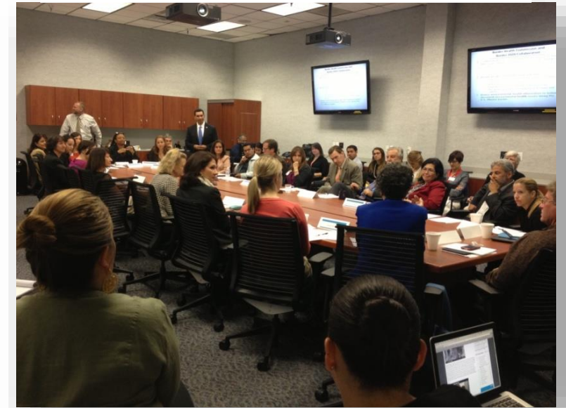
SDBHC formed in 2011