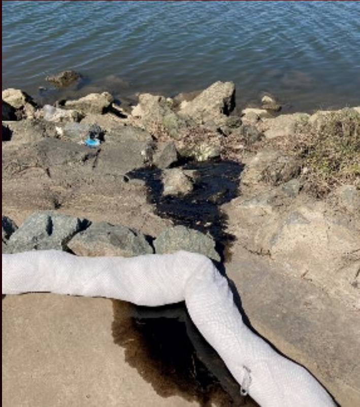
• Chula Vista