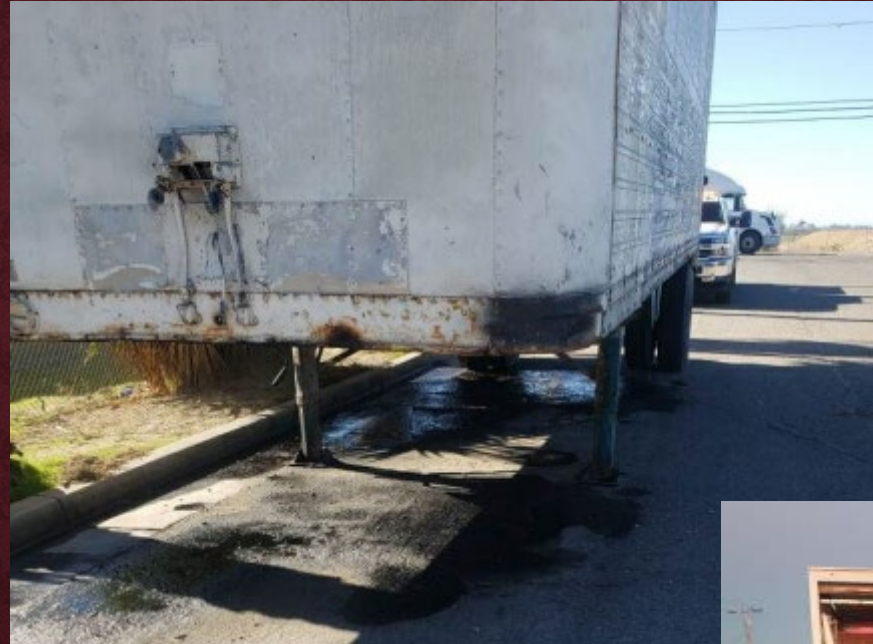
South San Diego