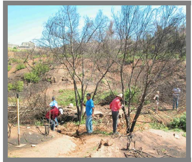
Blossom Valley Riders restoring a popular community trail damaged by the 2003 Cedar Fire

The following proposed community trails and pathways map index was completed by the Lakeside Community Planning Group and will be used as a reference tool. Neighboring communities are italicized and where trail or pathway connections exist, the community trail name and number are noted.