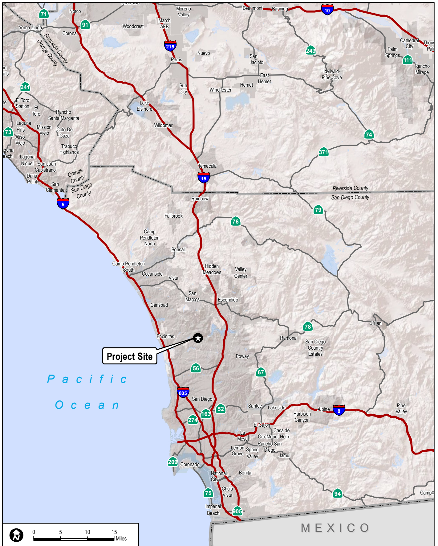
FIGURE 1 Regional Vicinity