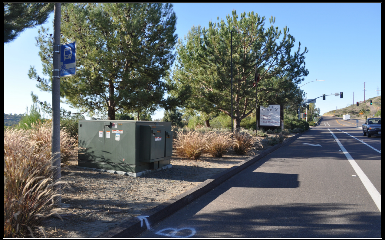
Figure 4: Del Dios Highway Southern Road Shoulder, Looking West