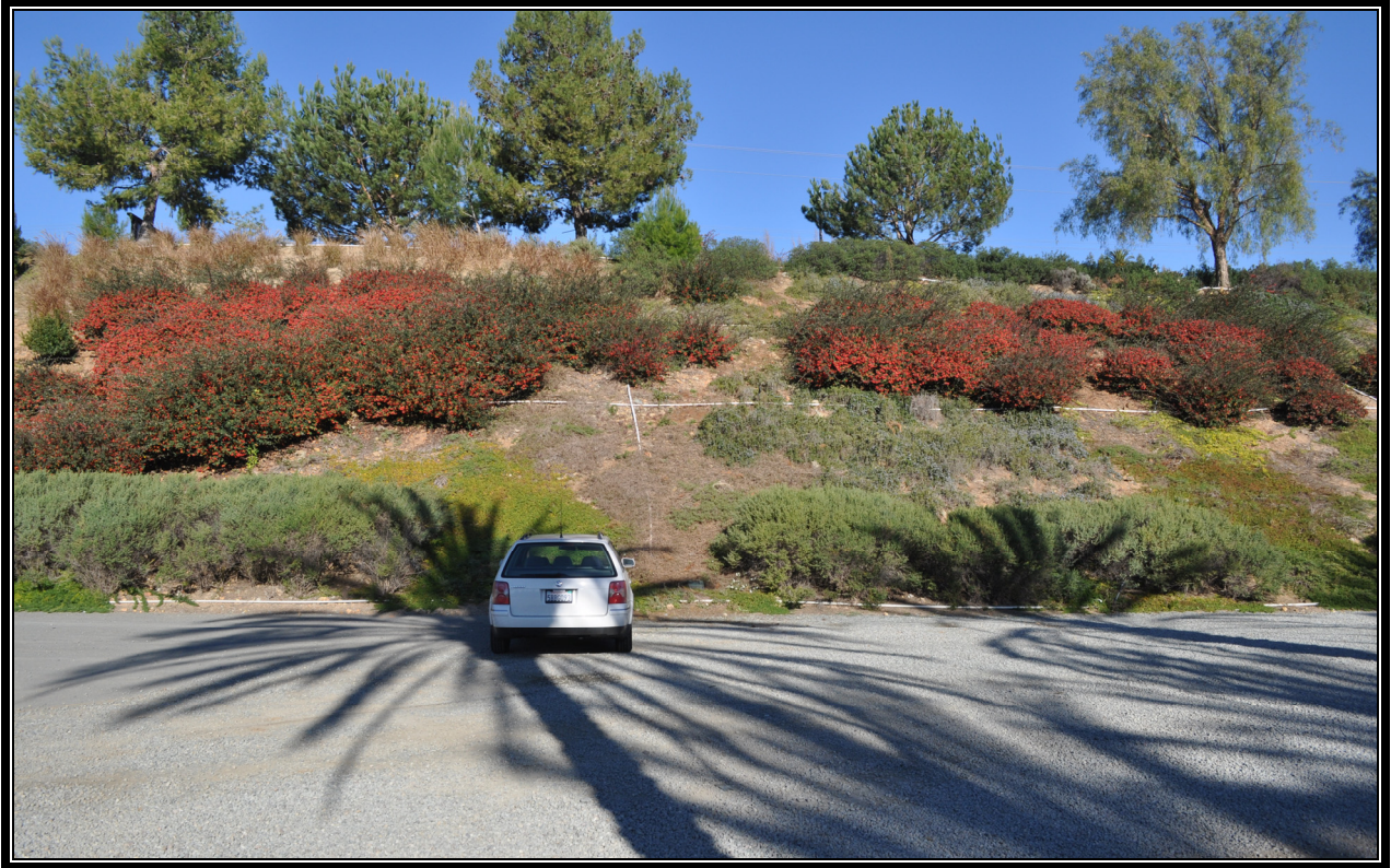
Figure 6: Cut Slope below Del Dios Highway, Looking North