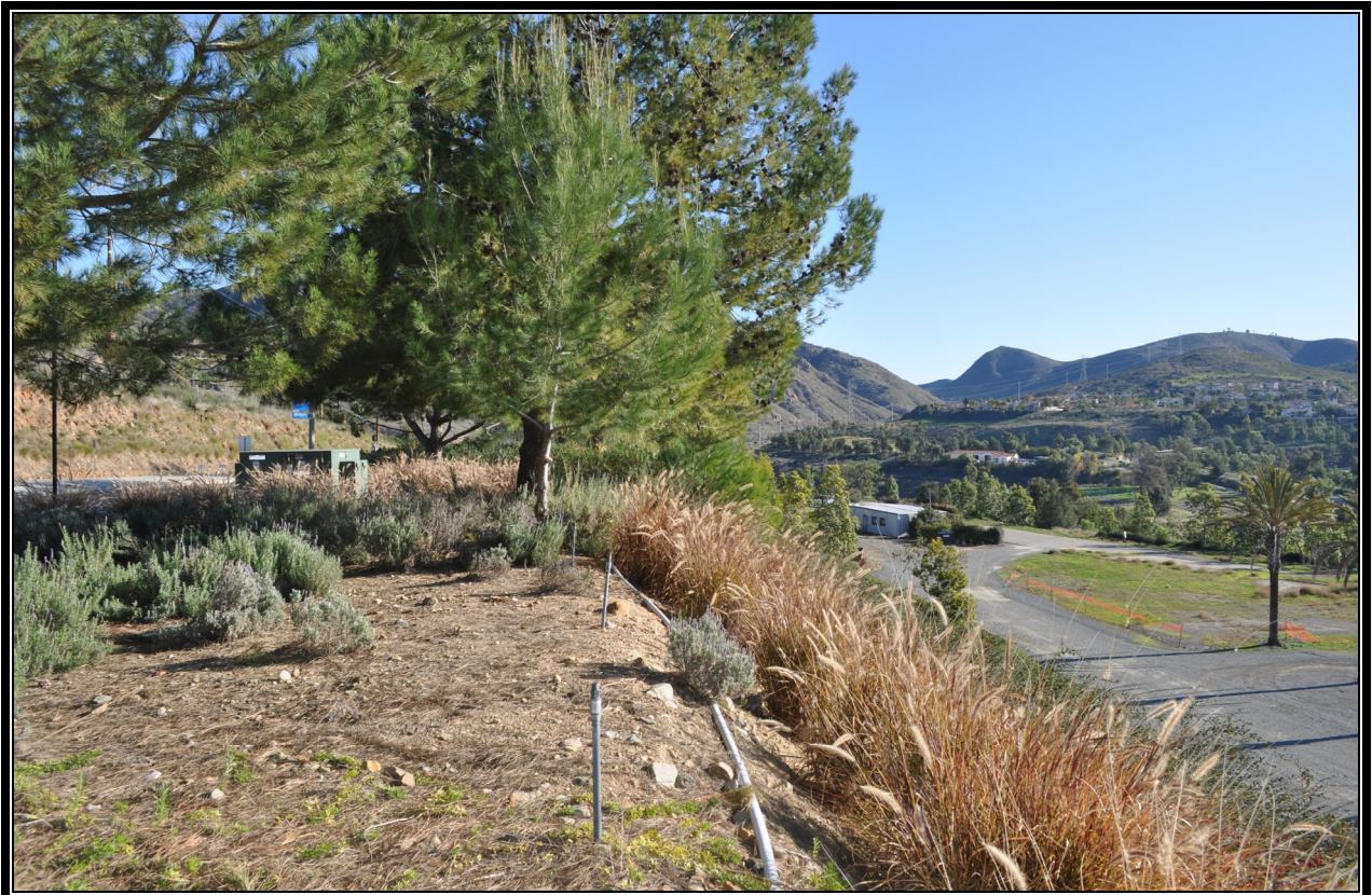
Figure 5: Del Dios Highway Southern Road Shoulder and Cut Slope, Looking East