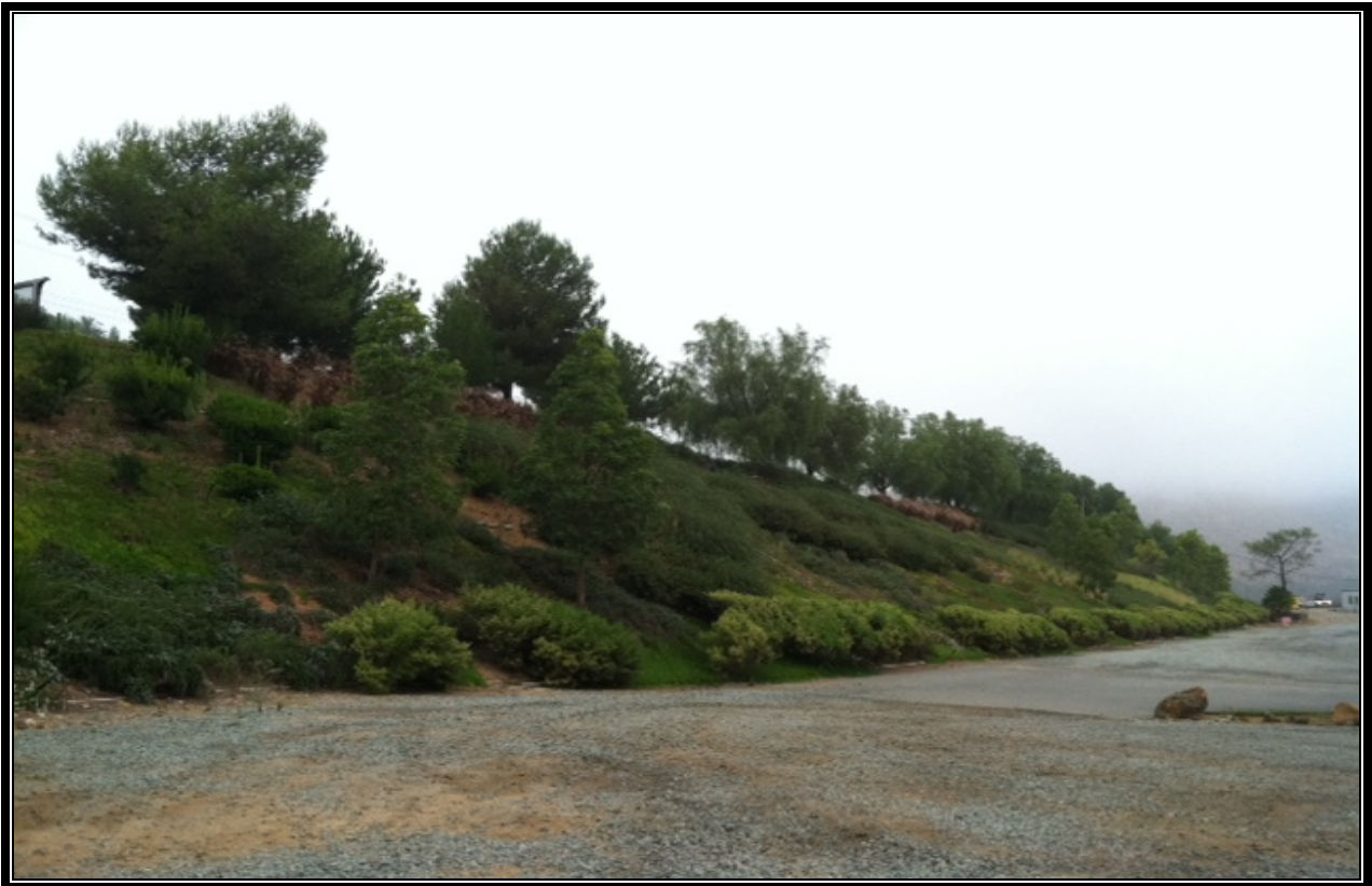
Figure 7: Cut Slope below Del Dios Highway, Looking Northeast