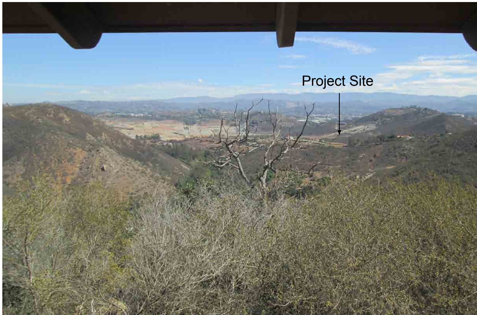
View to Project from Harmony Grove Overlook in Elfin Forest Recreational Reserve.