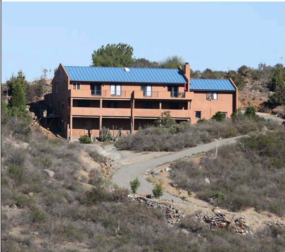
Northeast of Project