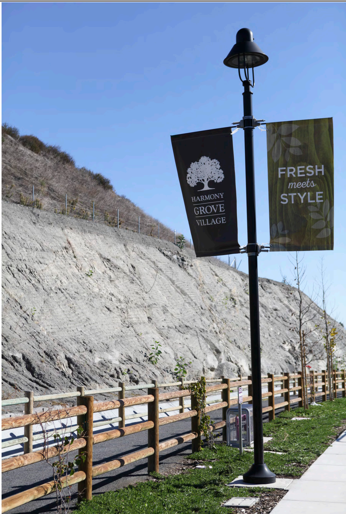
HGV Sidewalk, Pathway and Slope Adjacent to Roadway