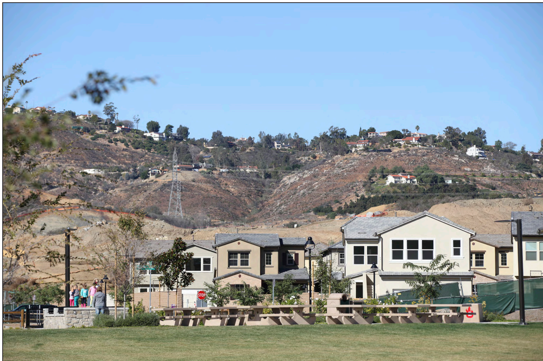
HGV Homes, Grading, and Portion of Park, with Existing Single and Multi-story Residences