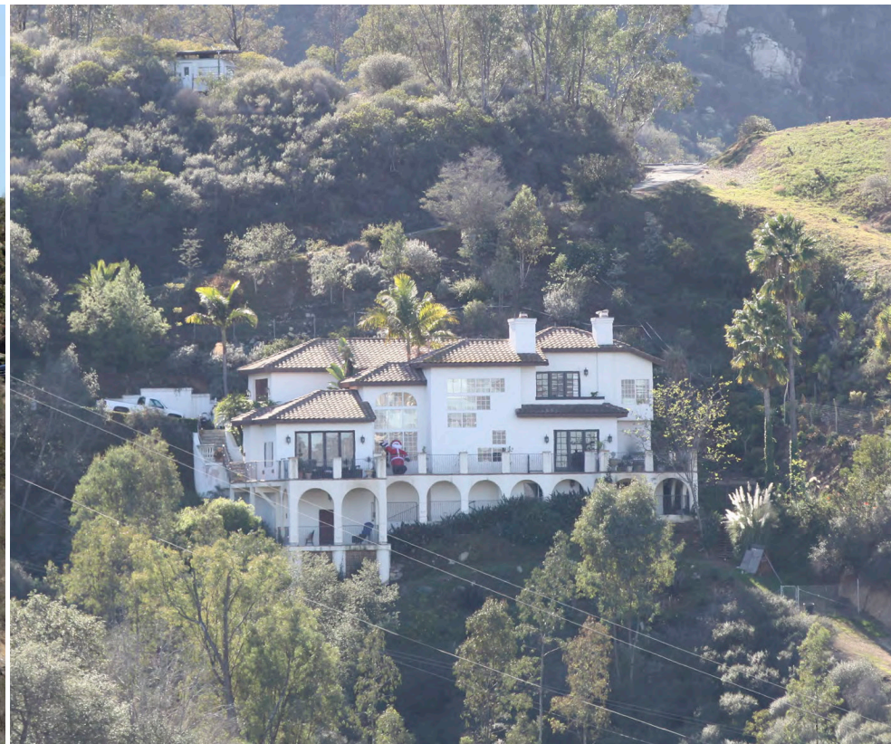
Southwest of Project