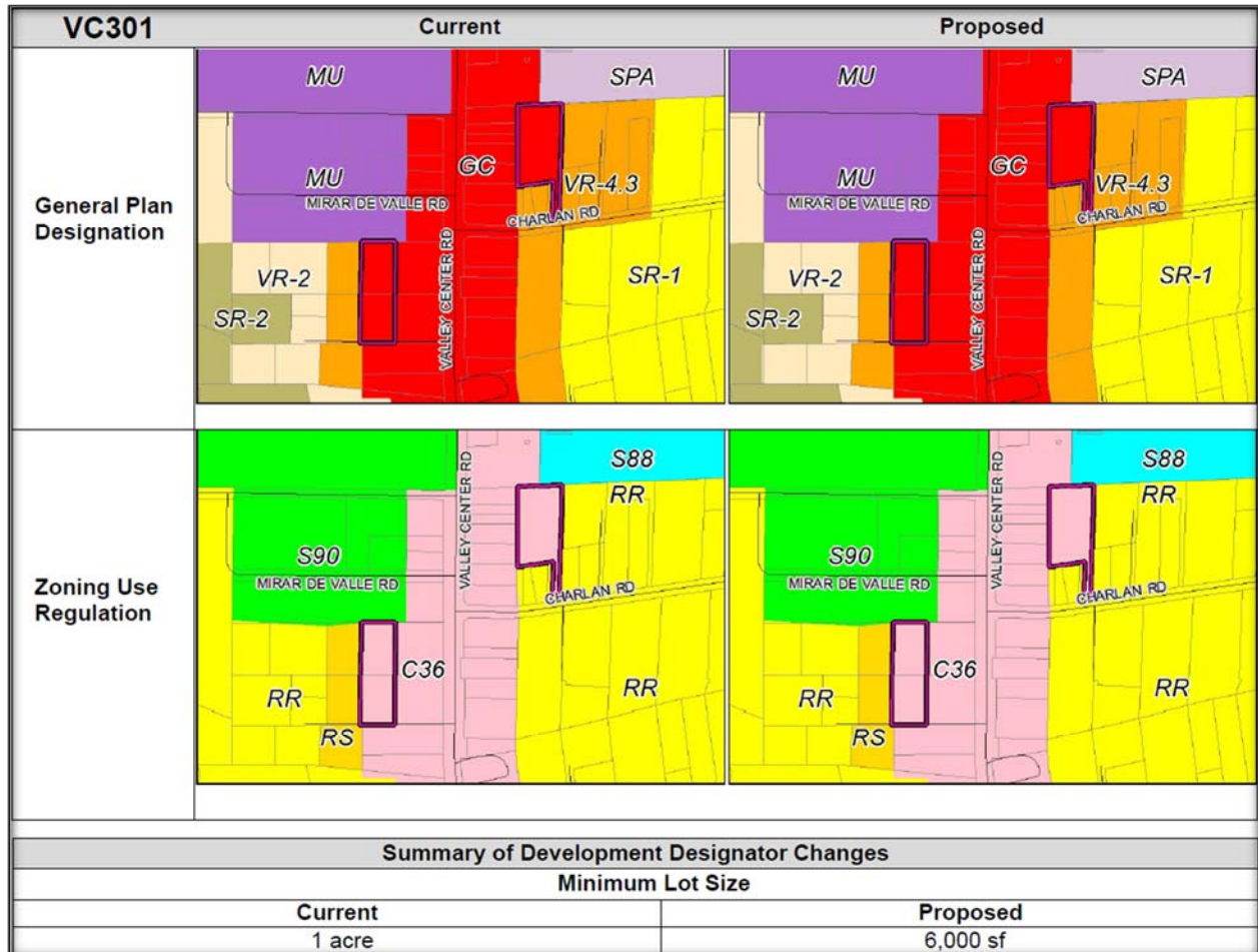
Figure 3 – VC301 Existing and Proposed Land Use Map/Zoning Designations

Figure 3 illustrates the existing and proposed Land Use Map/Zoning designations for VC301.