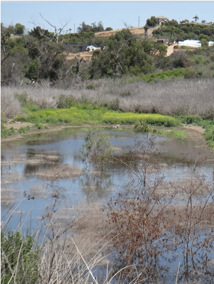
Unincorporated areas of the county are vulnerable to flash flooding.