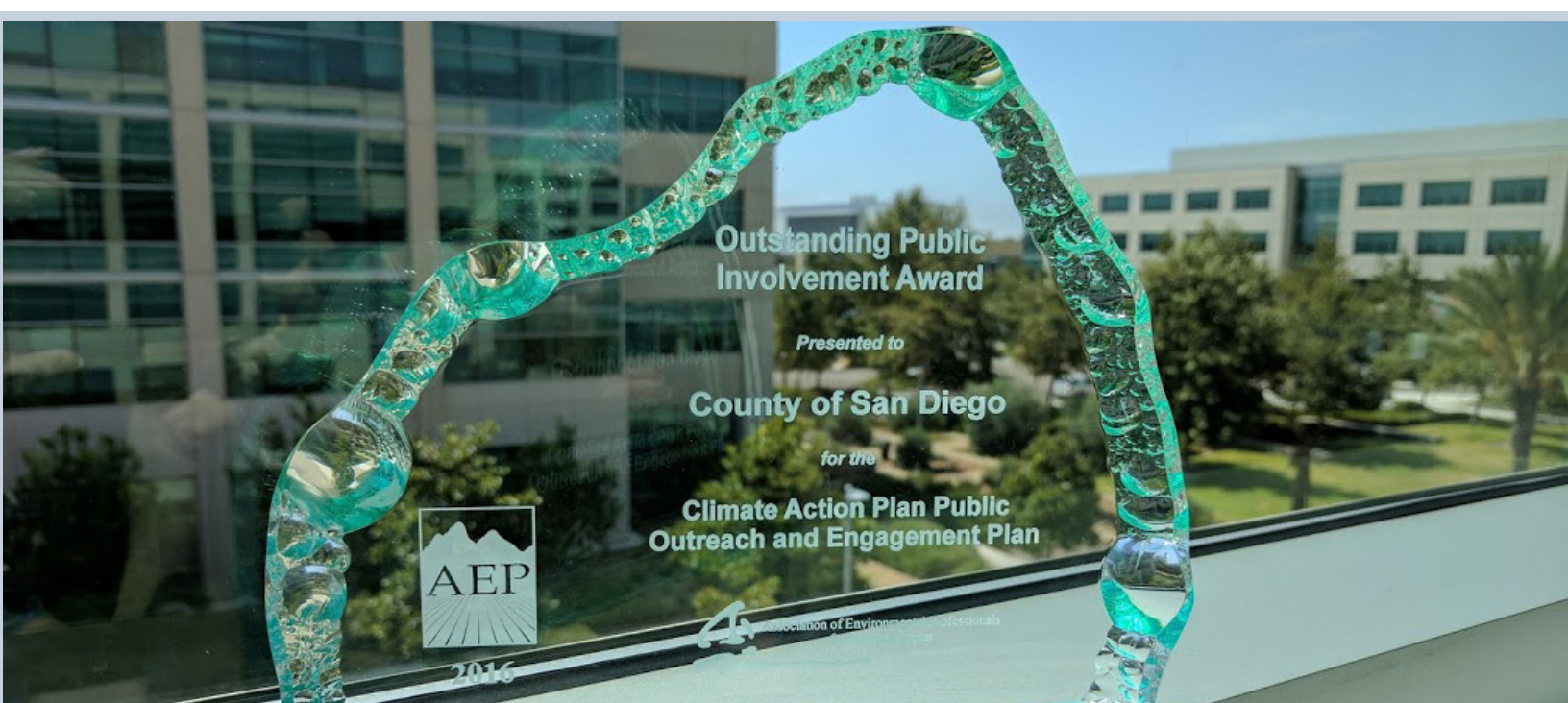
The Public Outreach and Engagement Plan was awarded the "Outstanding Public Involvement" award at the 2016 AEP San Diego Chapter Awards.

The Outreach Plan for the CAP was granted the "Outstanding Public Involvement" award at the Association of Environmental Professionals (AEP) San Diego Chapter Awards and Scholarship Banquet on October 6, 2016. This recognition illustrates the county's commitment to collaborating with regional partners, stakeholders, and members of the community throughout the climate planning process.