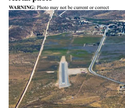
Photo taken 18-Apr-2017 looking west-southwest.

Do you have a better or more recent aerial photo of Jacumba Airport that you would like to share? If so, please send us your photo.