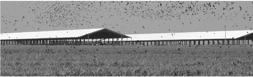
Figure 2. Tricolored Blackbird colony in field of triticale adjacent to a dairy in Kern County, California.

measure the size of the occupied area, I plotted both the dimensions from visual estimates and the coordinates measured by GPS into Google Earth. After birds had finished breeding, I also searched accessible but apparently unoccupied areas to confirm the absence of nests.