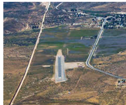
Photo taken 18-Apr-2017 looking west-southwest.

WARNING: Photo may not be current or correct