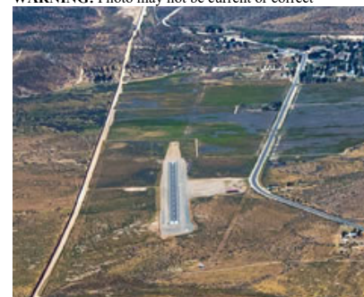
Photo taken 18-Apr-2017 looking west-southwest.

WARNING: Photo may not be current or correct