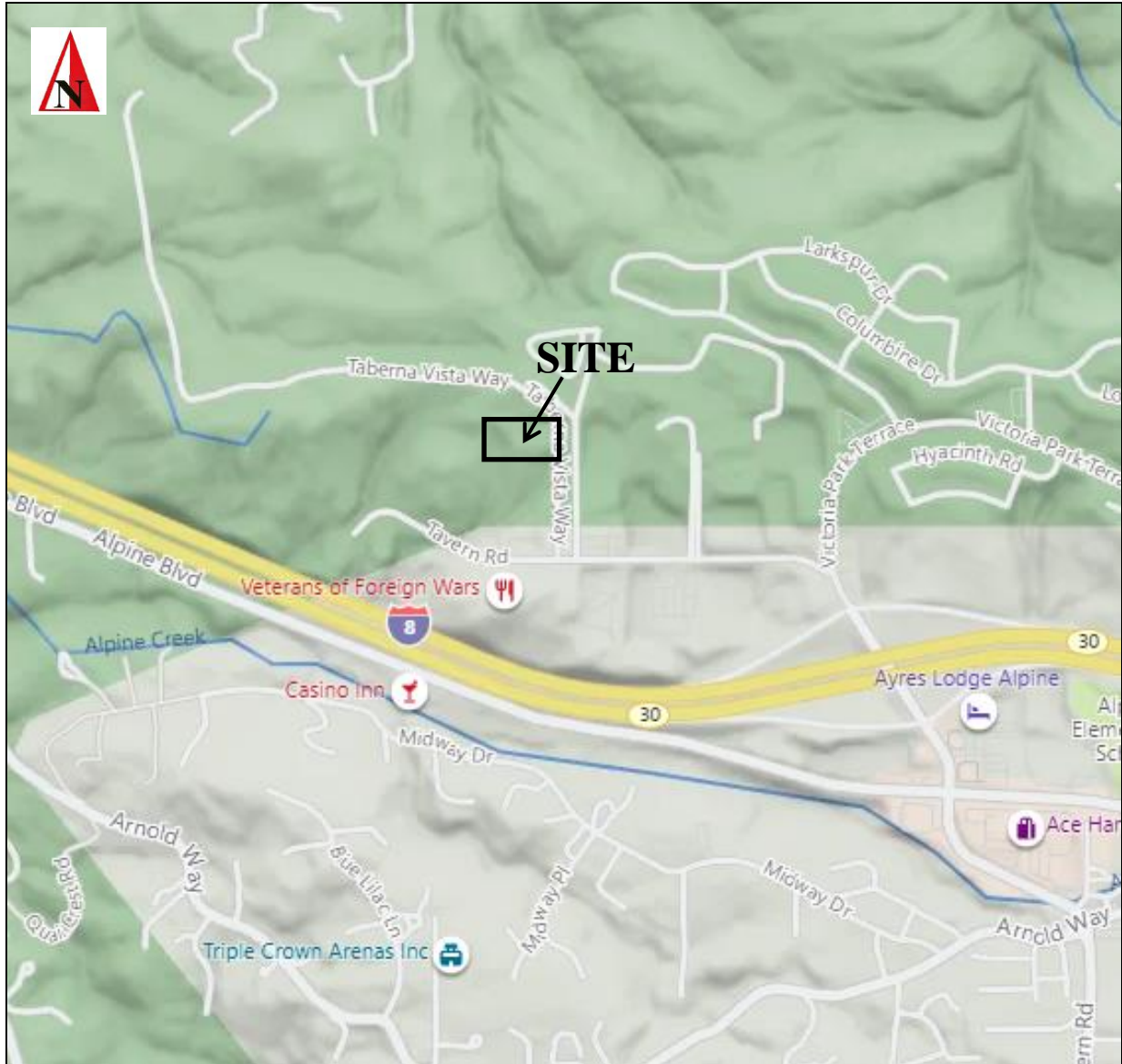
FIGURE 1 VICINITY MAP