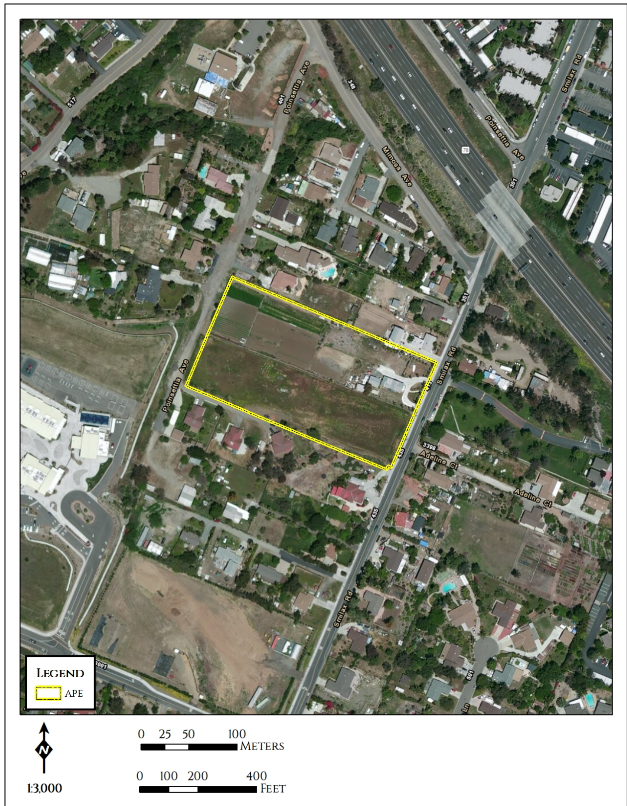
Figure 2. Project area shown on an aerial photograph.