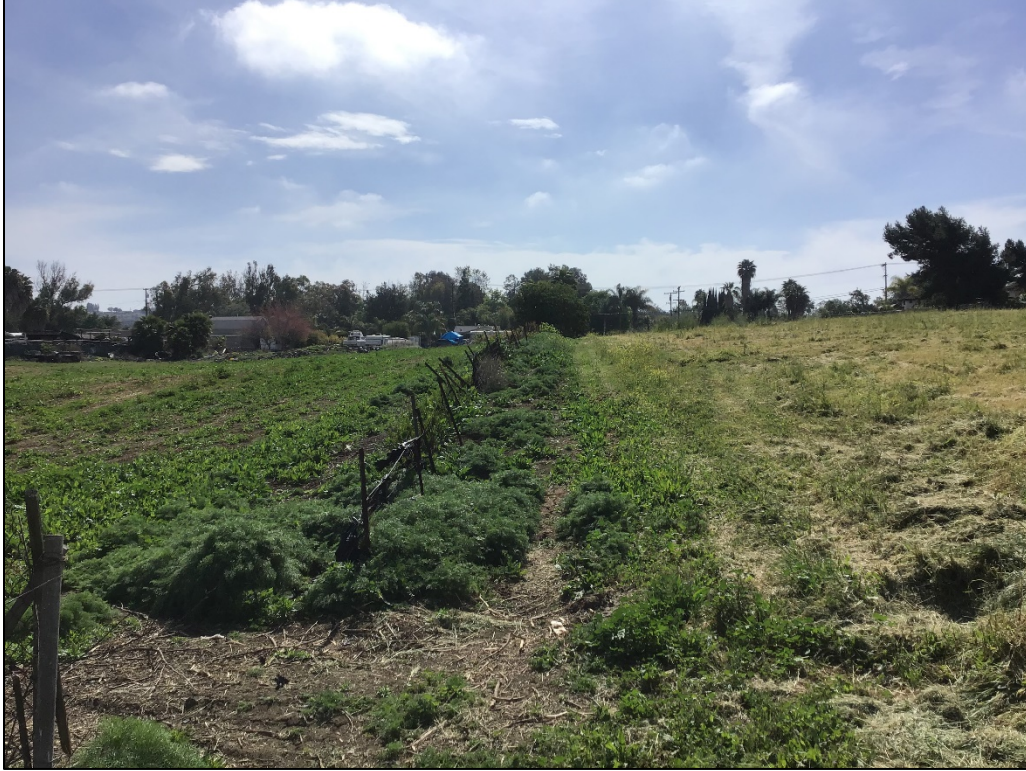
Figure 3. View of the project area, facing north.