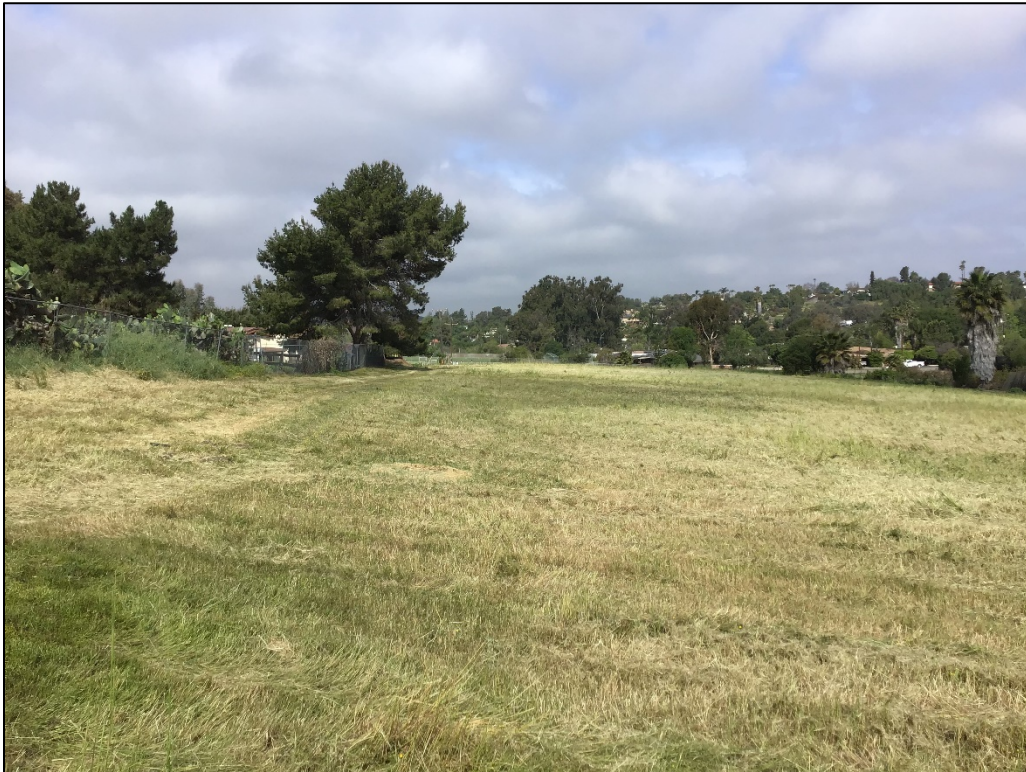
Figure 4. View of the project area, facing east.