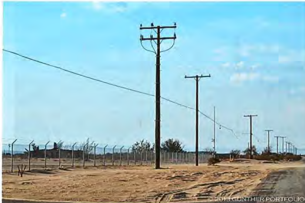
From Sotec Newberry Springs CPV Plant

As I assessed the situation, not one but two Good Samaritans driving by offered assistance. Since the temperature was about 107 Fahrenheit (41.7 Celsius), I got the impression folks living in the desert are sensitive to the dangers and eager to pay it forward just in case they need help one day.