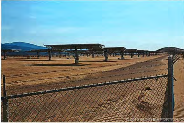
From Soitec Newberry Springs CPV Plant

Soitec also said the San Diego facility is supposed to reach its full 280 MWp (MegaWatt-peak) production capacity by October 2013, implying the addition of two (2) front-end assembly lines.