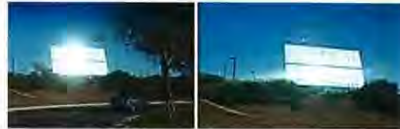
Newberry Solar 1 layout

Troublesome is another Land Use document associated with the county's negative EIR declaration. In the document, San Bernardino County CEQA Addendum To The Mitigated Negative Declaration , the county willy-nilly skips over the environmental impact assessments of concerns that appear to require assessment under an Environmental Impact Review. No mention of an earthquake fault running through the property; and remarkably, in Table Two (below on bottom of this page), concern with sun glare reflecting off of the 7-foot metal frames that was in the original Hoffman application, was apparently resolved in the Soitec application by placing the photovoltaic panels high in the air to track the sun. County slants and appraises everything as not having any significant environmental effect(s) ; therefore, streamlining the county's self-serving interests in not having to handle, as the lead agency, an otherwise mandated EIR. Page 4 of document.