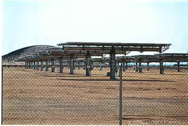
From Soltec Newberry Springs CPV Plant

Through onsite and photo analysis, I was able to confirm there are 60 CX-S530 CPV systems at Newberry Solar I. However, the arrangement differs from the Site Plan submitted in the San Bernardino County Conditional Use Permit . From north to south, the CPV systems are built in six (6) east to west oriented rows of 14, 14, 13, 6, 6, and 7. I think each row of CPV systems is justified towards the western edge of the property as shown in the inset photos and the Picasa slideshow. It appears Newberry Solar I was built on the northern Area A sized 14.4 acres (5.75 hectares) shown on the Site Plan.