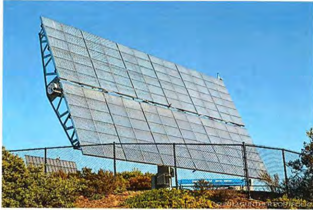
From Sotesc San Diego