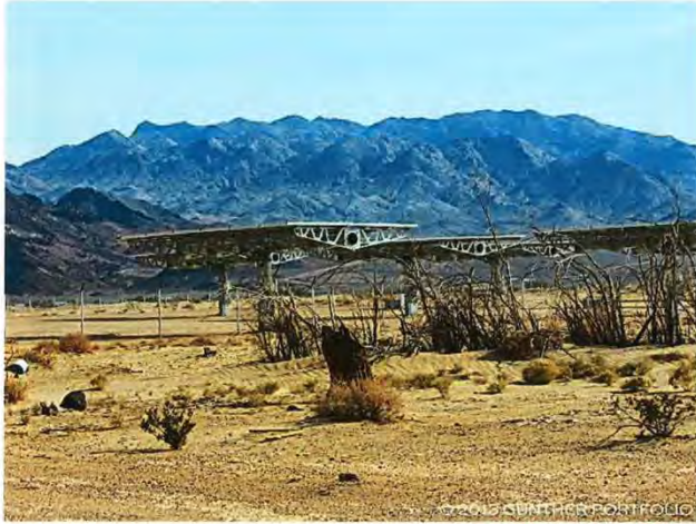
From Soitec Newberry Springs CPV Plant

I surveyed the site and neighboring properties for visual impacts and glare. The property to the north appears abandoned with nothing but building ruins. Neighbors to the east and west will have obstructed views of sunsets and sunrises respectively but still have good mountain views to the north and south. The southern neighbor will have certain views of the distant northern mountains obstructed. I could not assess the full impact of glare from the project since the systems were stowed. The metal trackers themselves did not create any noticeable glare as can be seen in the photos. I guess I'll need to revisit the Newberry Solar I CPV plant again!