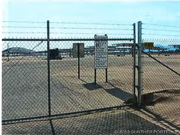
From Soltec Newberry Springs CPV Plant

Earlier, when I pulled onto the gravel shoulder of the I-40 access road to get my bearings to the project, another motorist stopped to check if I needed help. When I explained I was looking for the new solar plant, the resident directed me to the old parabolic trough Solar Electric Generating Station I (SEGS I) and SEGS II plants in Daggett. Not everyone in Newberry Spring knows or is concerned about the Newberry Solar I plant.