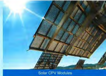
Solar CPV Modules