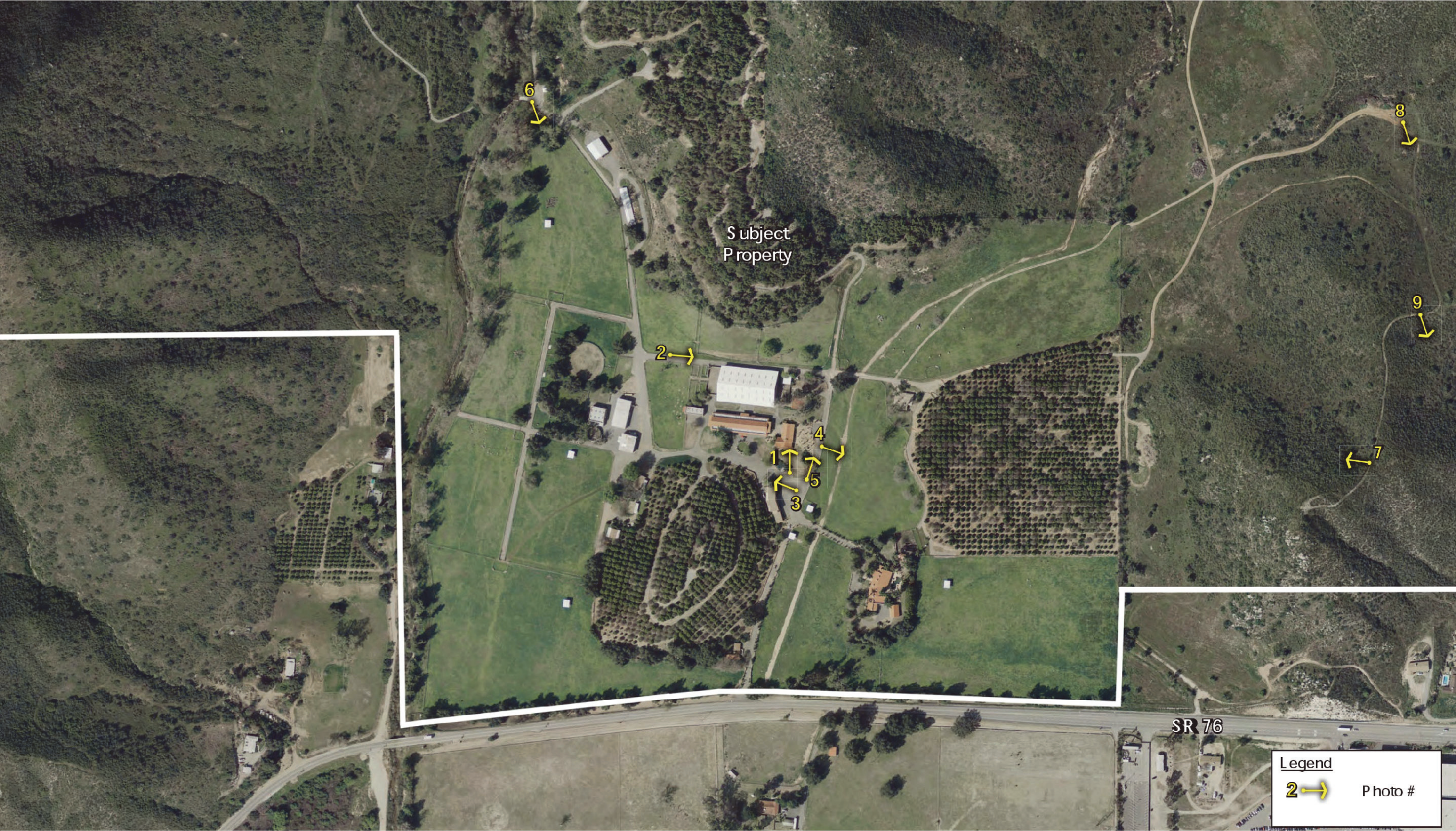
FIGURE 2.1-1A Photo Location Map - On-Site Views