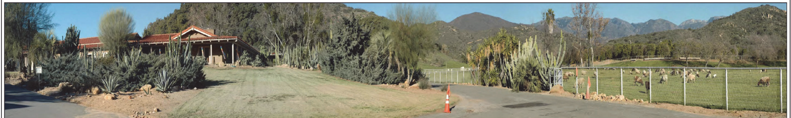
PHOTO 5: View looking north to northeast across Project site of existing ranch uses.