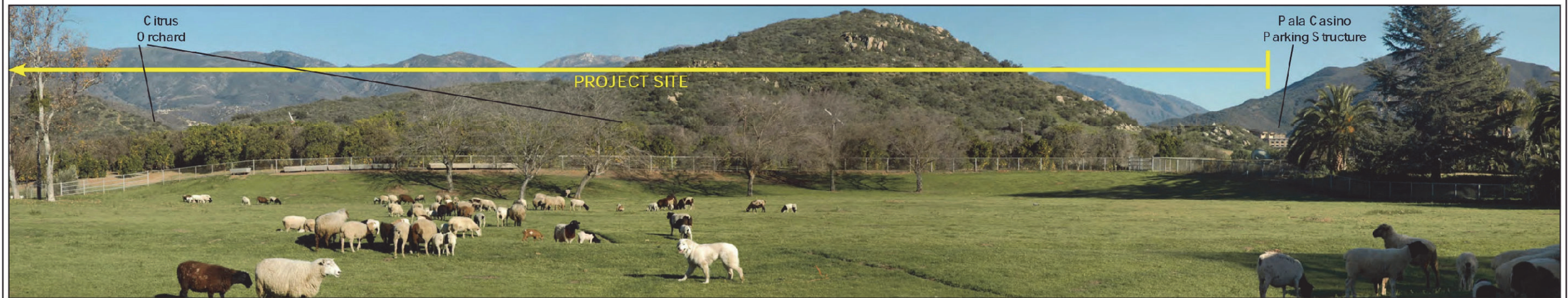
PHOTO 4: View looking northeast to southeast across existing onsite orchard/livestock grazing uses.