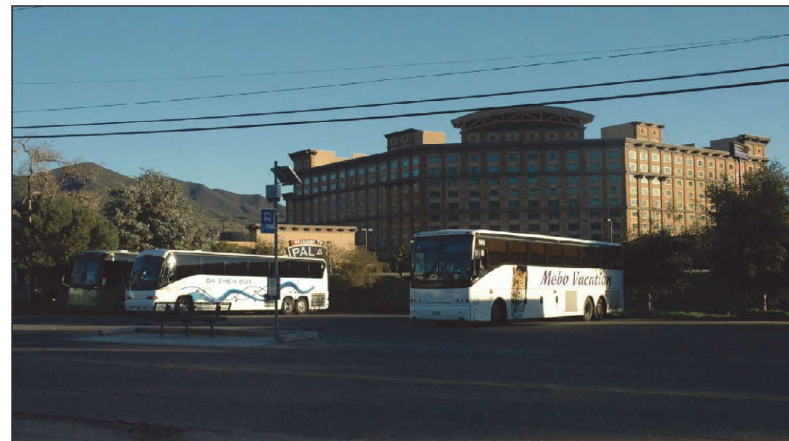
PHOTO 3: Pala Casino bus staging area just north of Pala Casino, adjacent to SR 76.