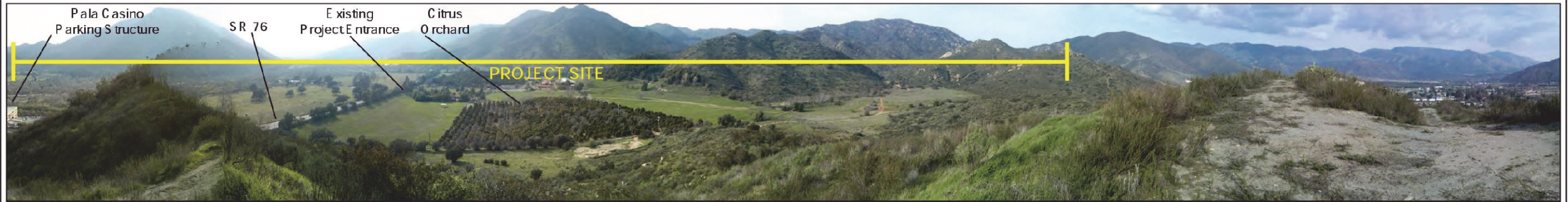
PHOTO 7: View looking southwest to northwest across Project site of existing ranch uses.