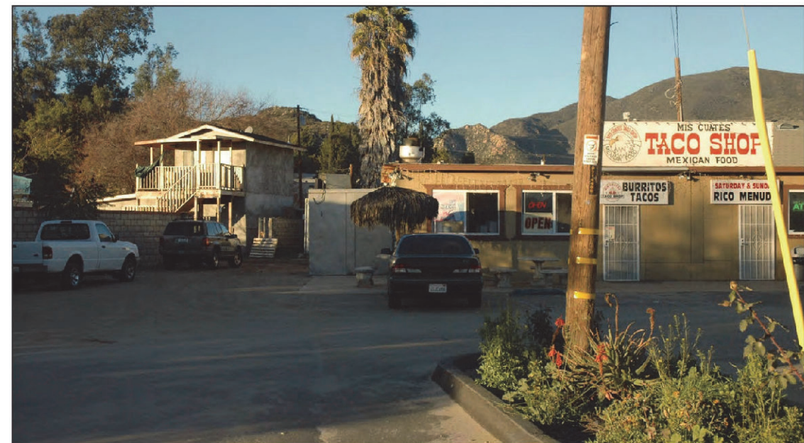
PHOTO 4: Small-scale retail and adjacent single-family residential uses, located north of Pala Casino, across SR 76.