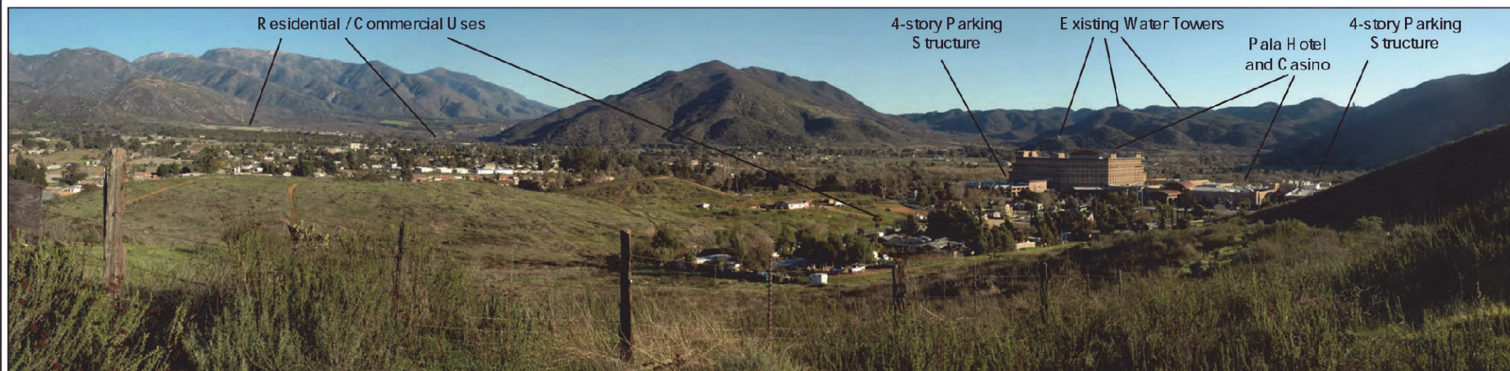
PHOTO 8: View looking northeast to southeast from eastern property boundary.