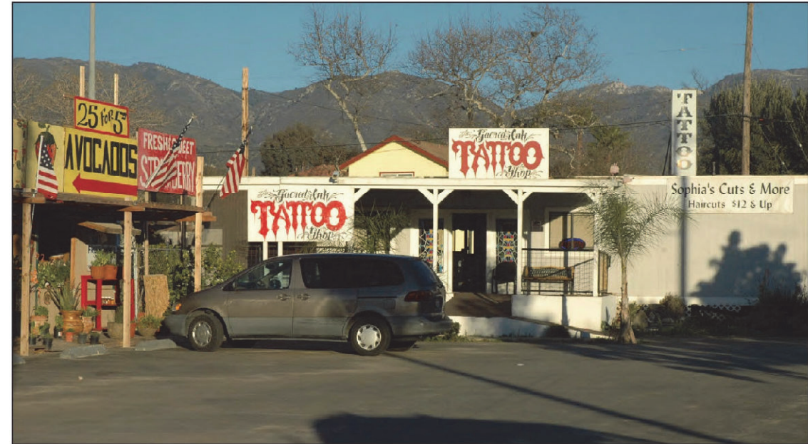
PHOTO 2: Small-scale retail uses located just north of Pala Casino, across SR 76.