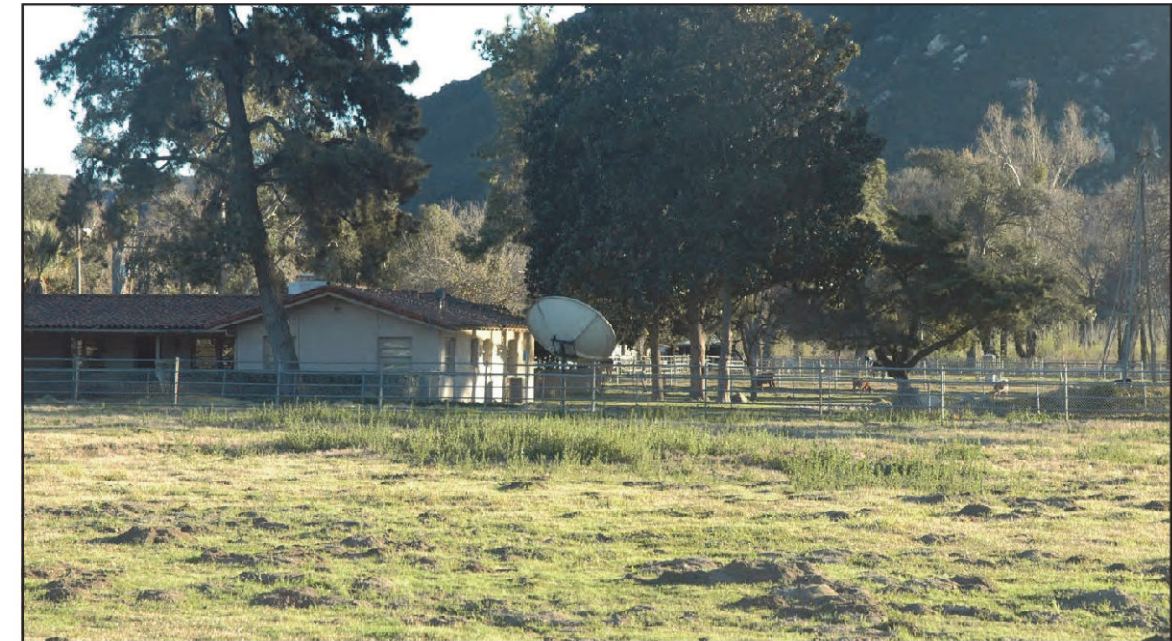
PHOTO 6: Existing ranch located southwest of Project site, across SR 76.