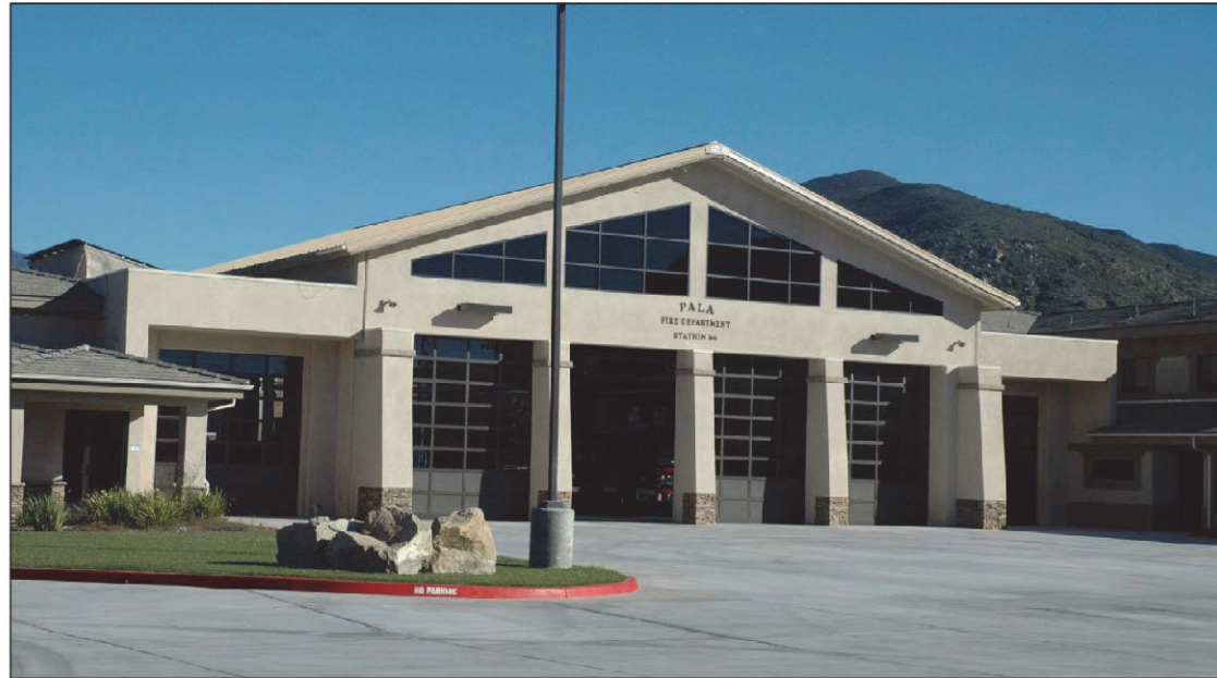
PHOTO 1: Pala Fire Department, located east of Pala Casino off SR 76.