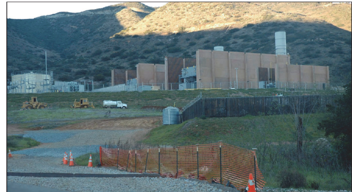
PHOTO 8: Sewer treatment plant located approximately one mile west of Project site, along SR 76.