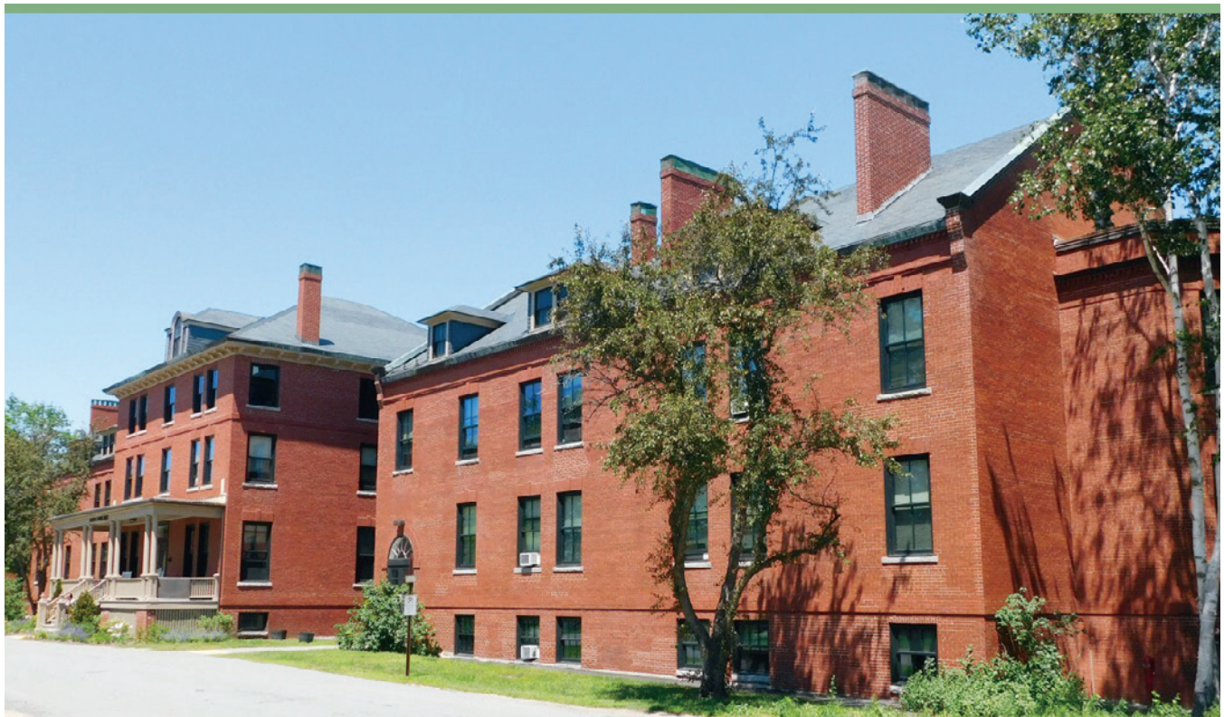
Portland, ME: Loring House.