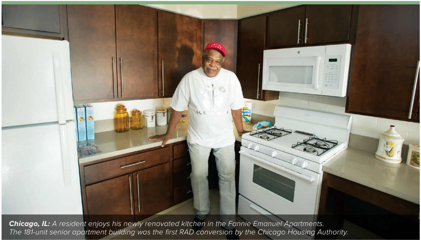
Chicago, IL: A resident enjoys his newly renovated kitchen in the Fannie Emanuel Apartments. The 181-unit senior apartment building was the first RAD conversion by the Chicago Housing Authority.

You should talk to a PHA representative if you have specific questions about the RAD conversion process and the specific plans for your property. You may also direct any questions to HUD at rad@hud.gov and Office of Recapitalization staff will respond confirming receipt and indicating next steps.