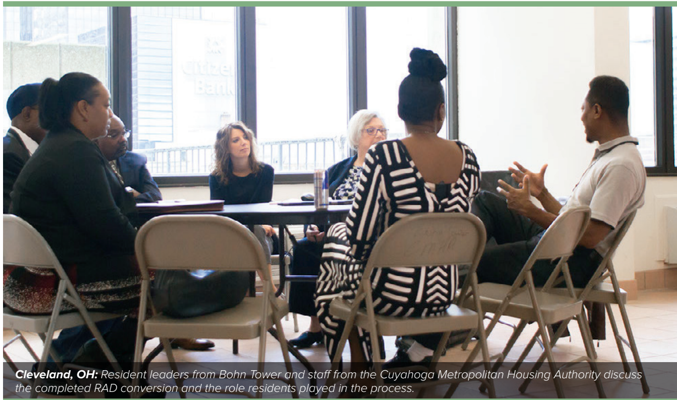
Cleveland, OH: Resident leaders from Bohn Tower and staff from the Cuyahoga Metropolitan Housing Authority discuss the completed RAD conversion and the role residents played in the process.

A “resident organizer” is a person who assists other residents in establishing and operating a resident organization, and who is not an employee or representative of current or prospective owners, managers, or their agents. Under RAD, property owners must allow resident organizers to assist residents in establishing and operating resident organizations. Resident organizers can be residents of the property they are organizing, or they can live elsewhere. If a property has a consistently enforced, written policy against canvassing, then a resident organizer who does not live at the property must be accompanied by a resident while on the property. If a property has a written policy favoring canvassing, or no policy about canvassing, any resident organizer must be afforded the same privileges and rights of access as other uninvited outside parties in the normal course of operation.