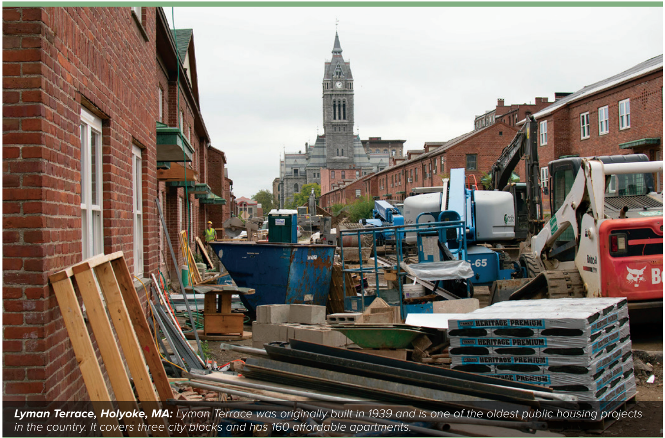
Lyman Terrace, Holyoke, MA: Lyman Terrace was originally built in 1939 and is one of the oldest public housing projects in the country. It covers three city blocks and has 160 affordable apartments.

For more information, see Fact Sheet #5: Resident Engagement .