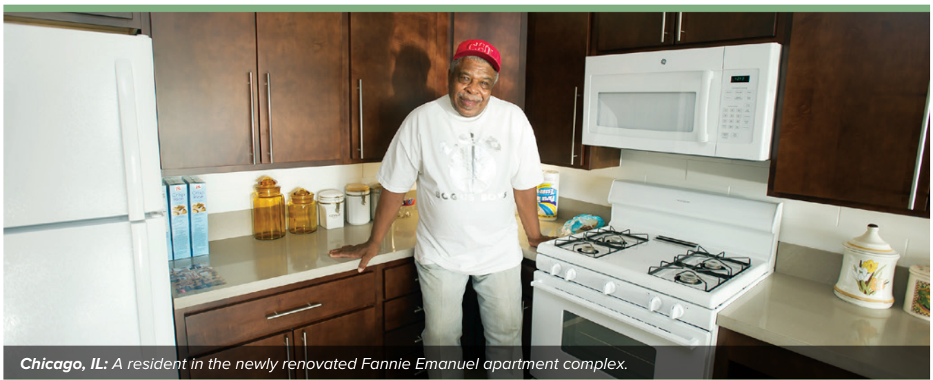
Chicago, IL: A resident in the newly renovated Fannie Emanuel apartment complex.

Yes, though you may have to wait for the PHA to have an available voucher to provide you. To issue vouchers through choice mobility, the PHA uses vouchers that become available as other families stop using them. Also, PHAs may adopt certain limits to the number of vouchers it uses for choice-mobility. For specific information, consult your PHA. (PHAs that do not have a voucher program will not have a choice mobility option.)